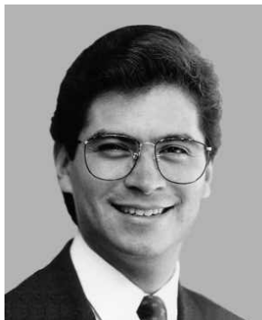
Xavier Becerra of Los Angeles (30th District) Democrat—3d term