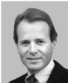
David Dreier of San Dimas (28th District) Republican—9th term