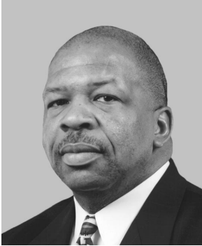
Elijah E. Cummings of Baltimore (7th District) Democrat—5th term