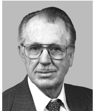
Roscoe G. Bartlett of Frederick (6th District) Republican—6th term