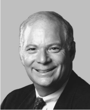
Benjamin L. Cardin of Baltimore (3d District) Democrat—9th term