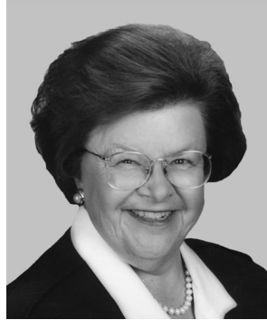
Sen. Barbara A. Mikulski of Baltimore Democrat—Jan. 3, 1987