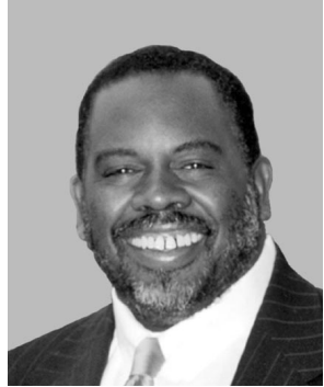
Albert Russell Wynn of Mitchellville (4th District) Democrat—6th term