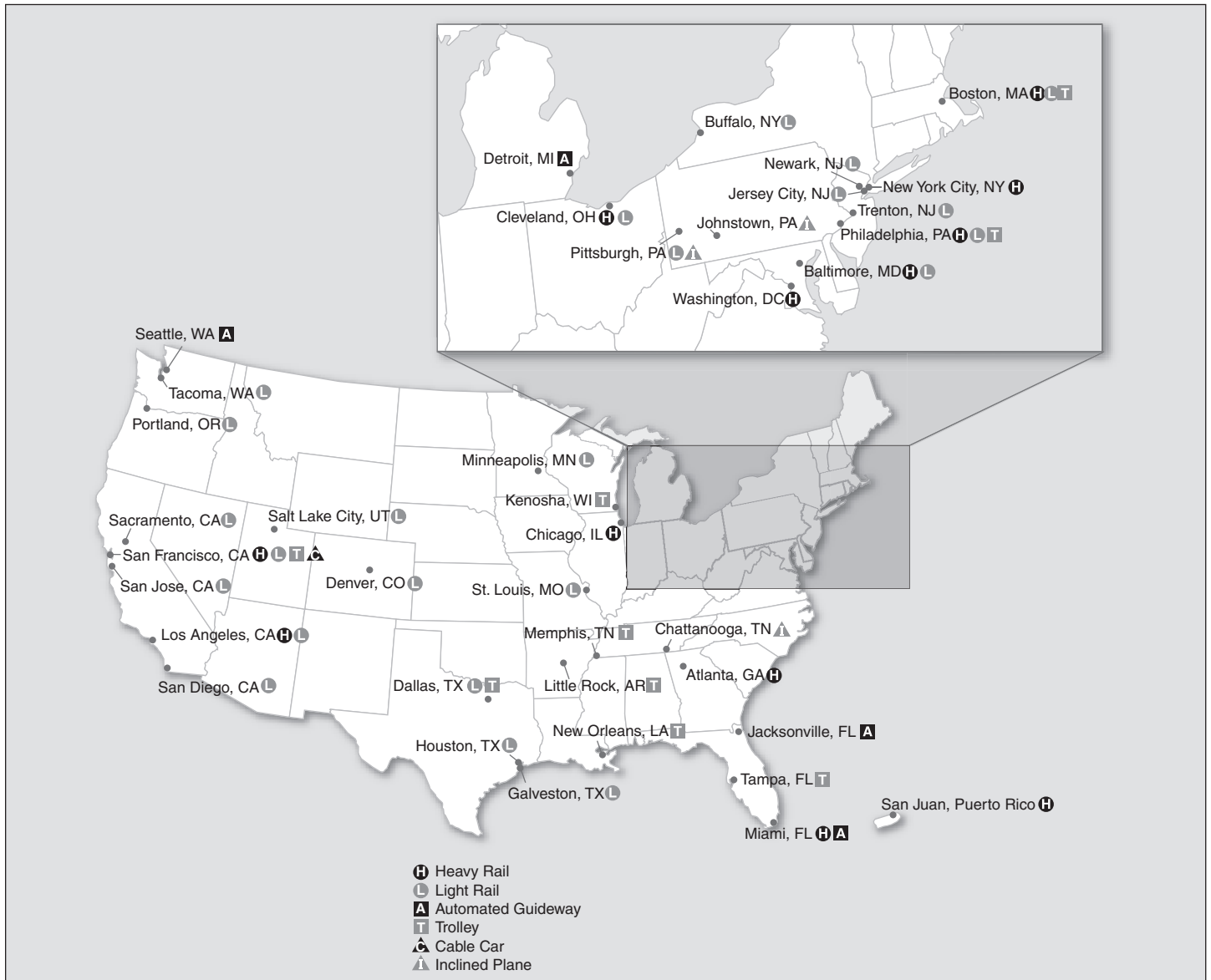
Figure 2: Locations and Types of Rail Transit Agencies Participating in State Safety Oversight Program