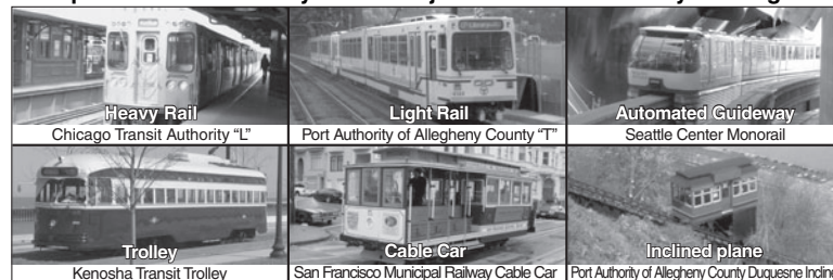
Source: Pennsylvania DOT; Seattle Center Monorail; San Francisco Municipal Railway; GAO.