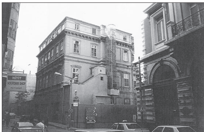
Figure 5: Previous and New U.S. Consulate General in Istanbul, Turkey