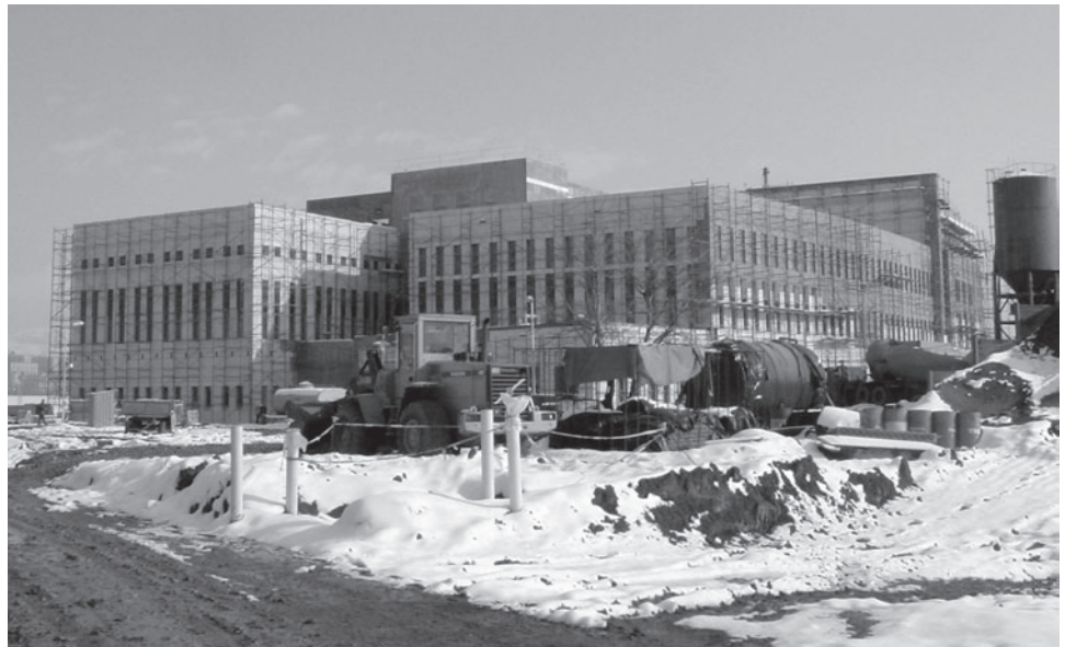
Figure 2: Construction of the Standard-design New Embassy Compound in Tbilisi, Georgia