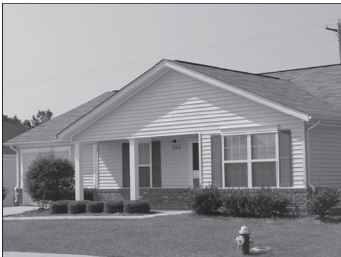
Figure 3: Newly Constructed (left) and Older (right) Privatized Housing at Robins Air Force Base, Georgia