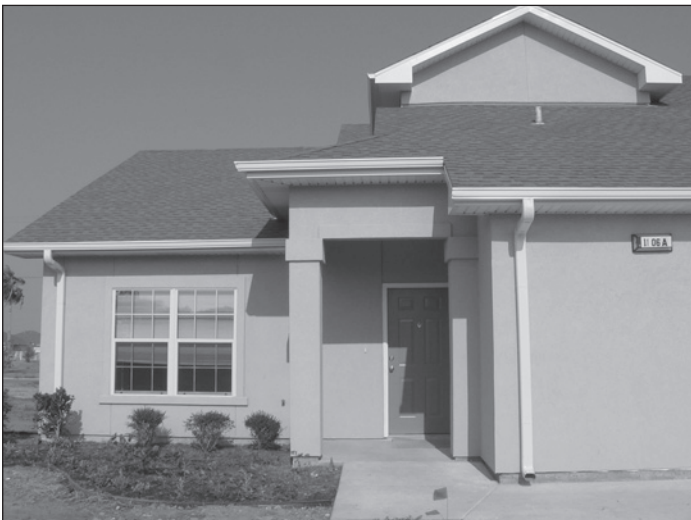
Figure 5: Newly Constructed (left) and Older (right) Privatized Housing at the South Texas Project (Naval Air Station Corpus Christi), Texas