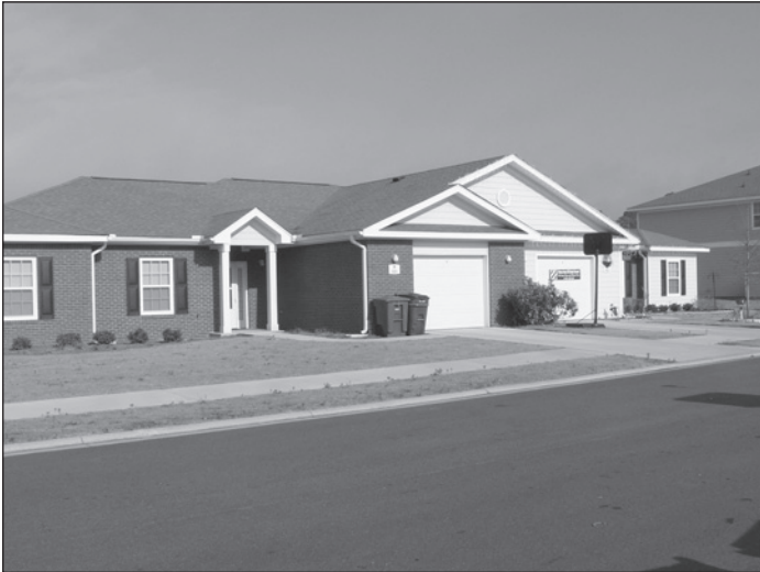
Figure 2: Newly Constructed (left) and Older (right) Privatized Housing at Fort Stewart, Georgia