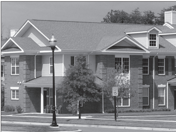
Figure 1: Newly Constructed (left) and Older (right) Privatized Housing at Fort Meade, Maryland

The duration of the initial development period—that is, the period when developers construct new housing units and renovate older units—varies among privatization projects, often lasting from 5 to 10 years. Thus, planned housing improvements resulting from privatization normally are not completed for several years after the projects are awarded. For all awarded projects as of September 2005, privatization developers had completed the construction of 10,911 new housing units and the renovation of 9,161 older housing units. Figures 1 through 5 show photographs of newly constructed and older privatized housing units at selected installations we visited.