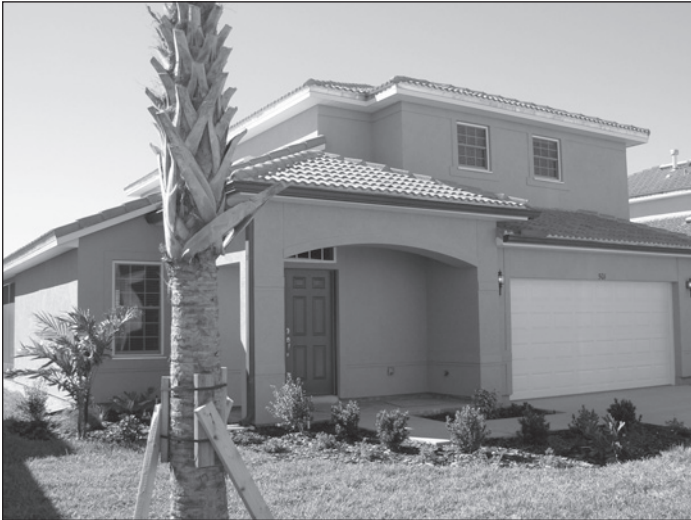
Figure 4: Newly Constructed (left) and Older (right) Privatized Housing at Patrick Air Force Base, Florida