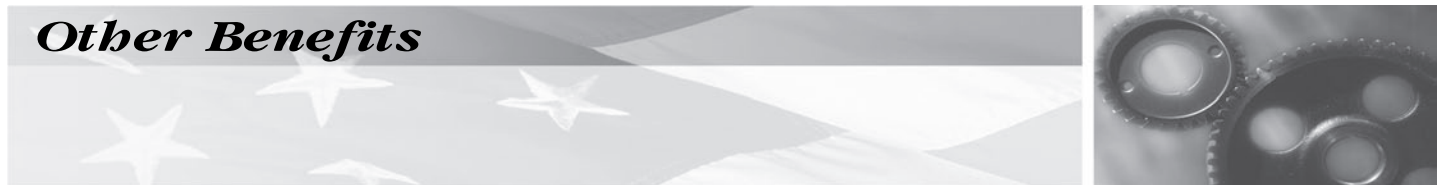
Figure 2: GAO's Selected Other (Nonfinancial) Benefits Reported in Fiscal Year 2005