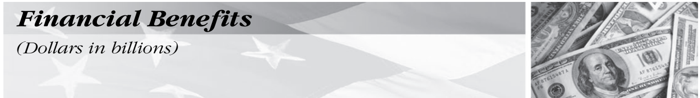
Figure 1: GAO's Selected Major Financial Benefits Reported in Fiscal Year 2005