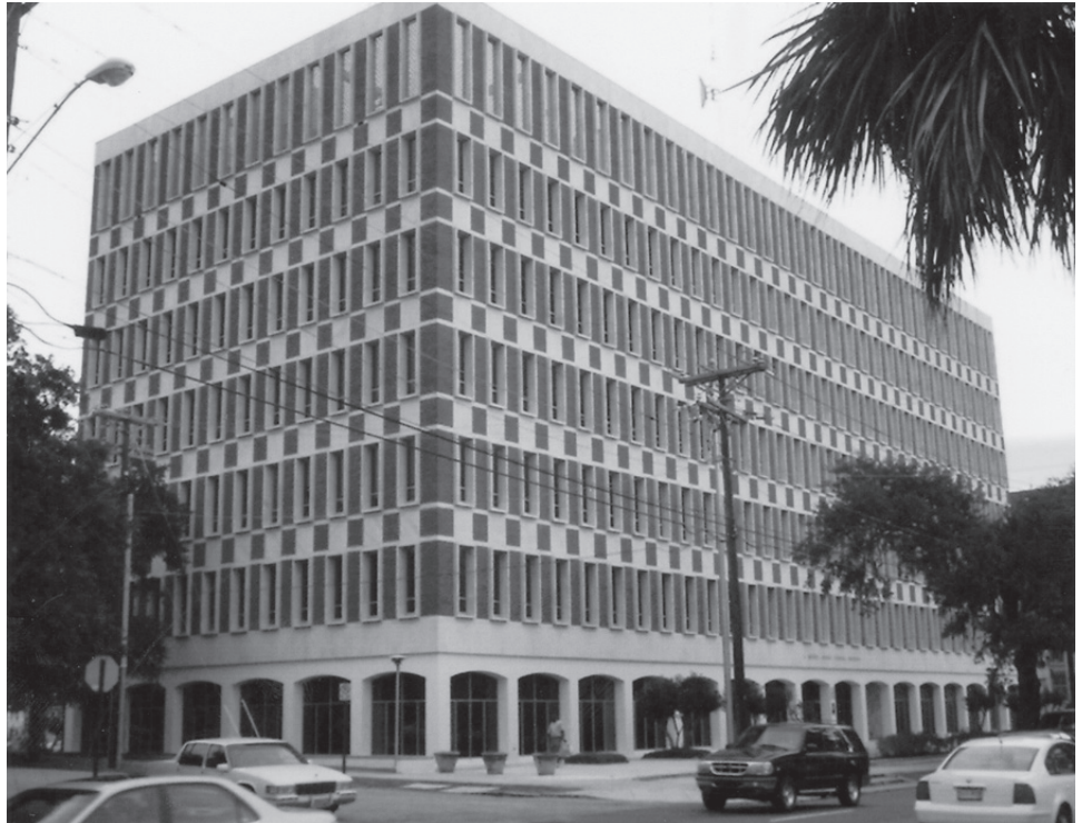
Figure 3: Example of Vacant GSA-Owned Property—The L. Mendel Rivers Federal Building in Charleston, South Carolina