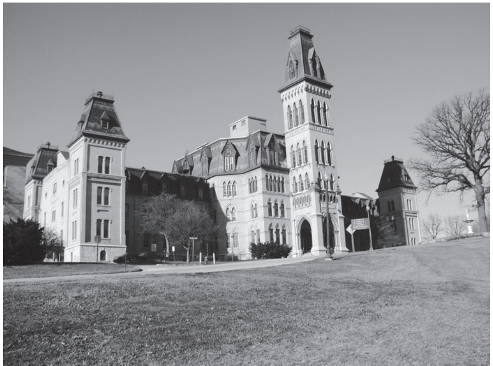
Figure 2: Example of Vacant VA-Owned Property—The Former Main Hospital Building on the Milwaukee, Wisconsin, Health Facility Campus

from inpatient to outpatient services. Subsequently, VA has struggled to reduce its large inventory of buildings, many of which are underutilized or vacant. In August 2003, we reported that VA had 577 vacant and underutilized properties. Figure 2 shows an example of a vacant VA-owned property in Milwaukee, Wisconsin.