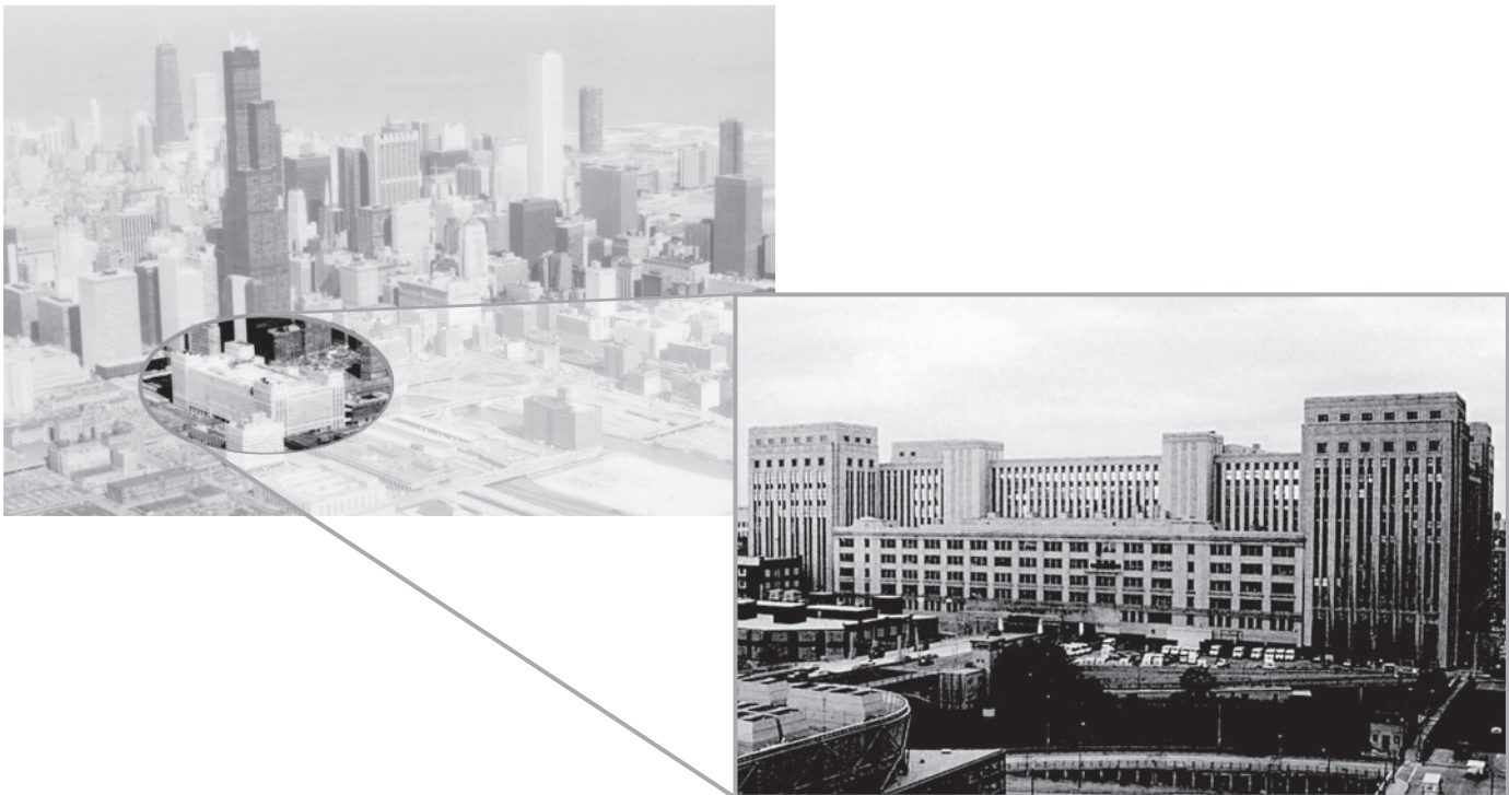
Figure 1: Example of Vacant USPS-Owned Property—the Former Main Post Office in downtown Chicago, Illinois

The former main post office building in Chicago, near the Sears Tower, is an example of a vacant USPS-owned property (see fig.1). USPS is currently incurring about $2 million in annual holding costs for this property, which was replaced by a new facility and vacated in 1997. Redevelopment of this property has taken several years because, according to USPS, the real estate market was weak and the City of Chicago and the developer have been unable to agree on terms. According to USPS, the property buyer is currently in negotiations with the City of Chicago regarding the property's redevelopment and the granting of certain tax exemptions from the City.