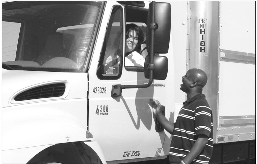
Figure 1: A Student in the Kentucky River Foothills R.O.U.T.E. Training Program in Richmond, Kentucky Trains for a Commercial Truck Drivers' License