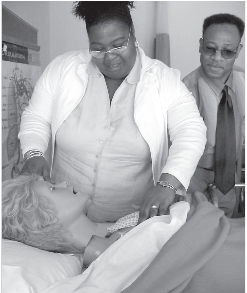
Figure 2: Participants in the District 1199C Training and Upgrading Fund Career Ladder Program Demonstrate Features of the Program's Nurse's Aide Training Facility