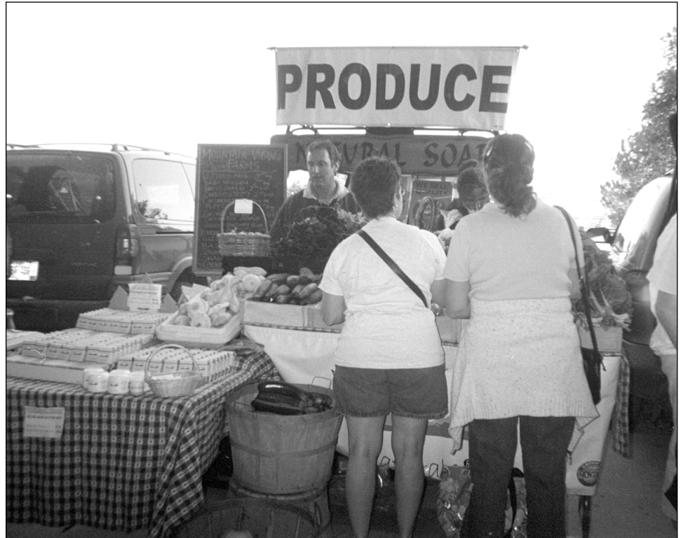
Figure 3: Vendors Sell Produce and Other Goods in the Career Transitions Farmers' Market in Belgrade, Montana, Where Microenterprise Students Can Test Their Business Ideas