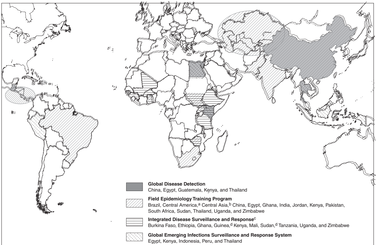
Figure 2: Countries with GDD-, FETP-, IDSR-, or GEIS-Related Activities Supported by U.S. Agencies, 2004-2006

Sources: GAO; Map Resources (map clip art).