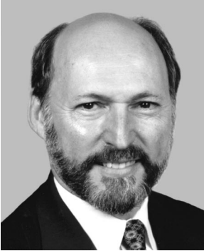
Alan Hantman Architect of the Capitol