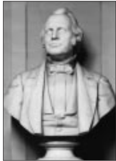
Henry Wilson by Daniel Chester French, 1885

In 1885, the Senate voted to place a marble bust of Henry Wilson in the Vice President's Room, to honor one of the Senate's most popular presiding officers. Before being elected vice president, Wilson had served as a senator from Massachusetts from 1855 to 1873. He played an important role during the Civil War, as chairman of the Senate Military Affairs Committee, and throughout his career championed legislation to aid the working class.