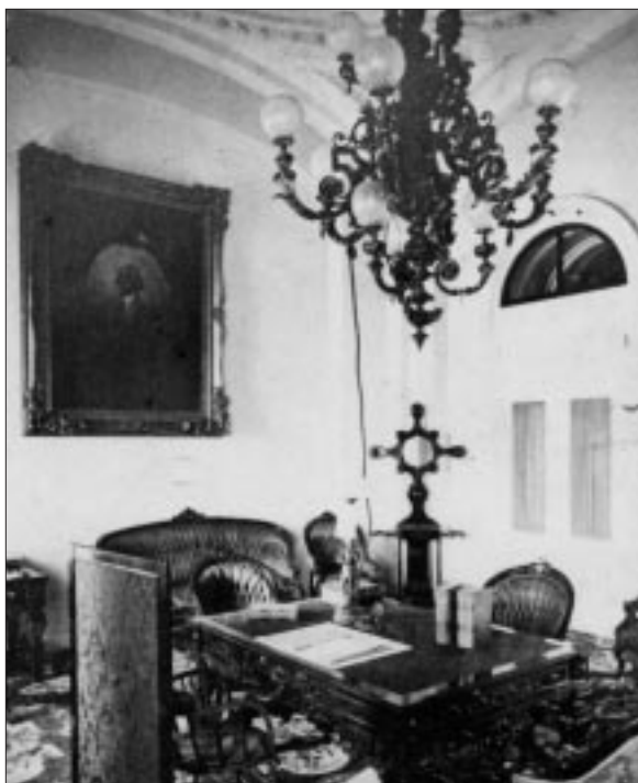
Earliest known photographic view of the room, c. 1870

The United States Constitution designates the vice president of the United States to serve as president of the Senate and to cast the tie-breaking vote in the case of a deadlock. To carry out these duties, the vice president has long had an office in the Capitol Building, just outside the Senate chamber.