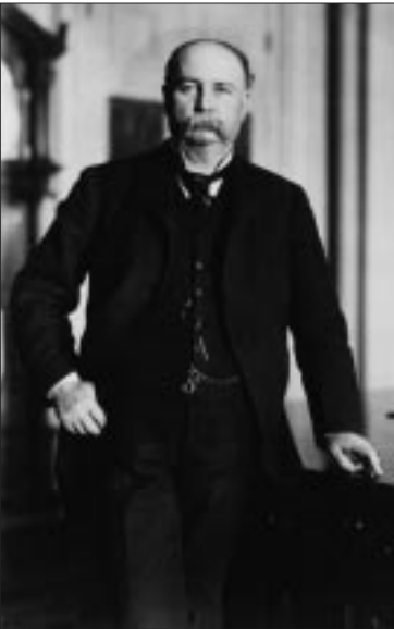
Vice President Garret A. Hobart

purchases of imported silk mohair carpeting, Neapolitan silk curtains, numerous Persian throw rugs, and “a silk velour slumber robe” made to order to match the velour cushions on his office sofa.