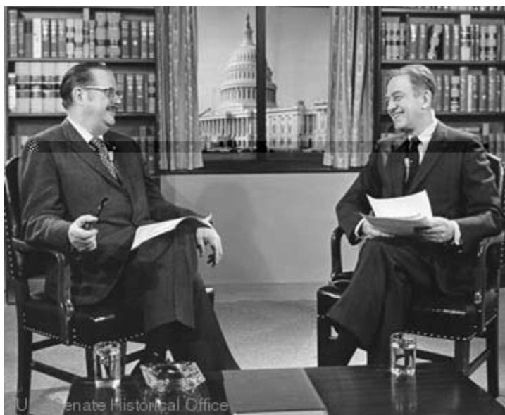
Senators Hugh Scott (R-PA) and Clifford Case (R-NJ)

Roman Hruska, in 1970 when the extension of the Voting Rights Act came along, when John Mitchell was Attorney General, the administration had a proposal. Phil Hart was alive then, and Hugh Scott and Hart had a proposal, both of them were on Judiciary. They had a different Voting Rights Act than did John Mitchell and the administration. Hruska was the administration spokesman and leading the fight for this thing. They reported out of the Judiciary Committee Roman Hruska's bill -- the administration's bill -- and at some point Scott and Hart offered theirs as a substitute. The debate went on for some days. Finally, one afternoon, Roman Hruska came into the back office where Scott was and said, "Hugh, I'm going to move at 4:00 o'clock to table your substitute." Scott said, "That's fine, Roman, whatever you want to do, that's fine." We had counted our votes and we knew that we had the votes to stop a tabling motion.