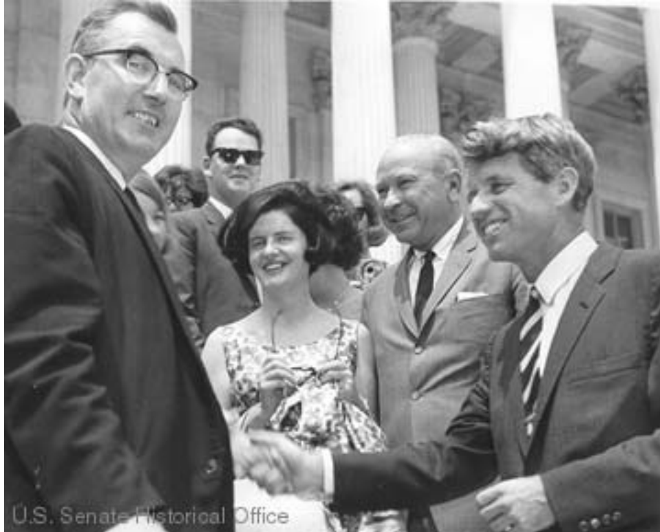
Senators Caleb Boggs (R-DE) and Robert Kennedy (D-NY) greet visitors on the steps of the U.S. Capitol Senate Historical Office page 98

Ritchie: Do you think a lot of senators feel uncomfortable about going into other states to campaign against colleagues, even though they're of a different party?