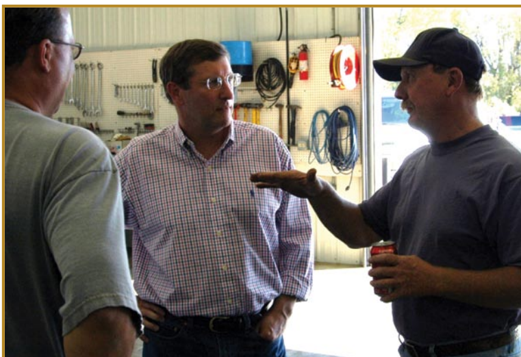
Senator Conrad talks with farmers about his ag disaster legislation.

Senator Conrad hopes an expanded farm disaster bill will bring relief to North Dakota's farm families this fall. "I've visited with North Dakota farmers and ranchers and walked their fields. They've been battered by bad weather. They need our help and they need it now," Senator Conrad says.