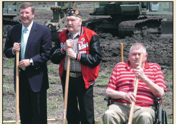
Lisbon – Senator Conrad is joined by two veterans as he helps break ground on the new Veterans Home.

Working with the other members of North Dakota’s congressional delegation, Senator Conrad secured a priority listing for federal funds for the Lisbon project through the VA State Home Grant program. As a result of the delegation’s efforts and overwhelming public support, the state legislature approved an additional $6.4 million in state funding for the new veterans home.