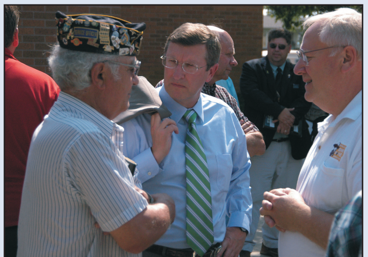
Dickinson – Senator Conrad meets with veterans at the opening of the new VA community based outpatient clinic.

Senator Conrad's budgets have also met the funding requested in the independent budget put forth by America's leading veterans organizations.