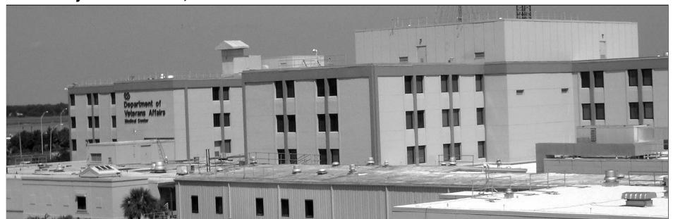
VA Facility in Charleston, South Carolina

The MUSC proposal for a new joint venture medical center presents an opportunity for exploring new ways of providing health care to Charleston's veterans, but it also raises a variety of complex issues for VA. These include the benefits and costs of investing in a joint facility compared with other alternatives, legal issues associated with the new facility such as leasing or transferring property, and potential concerns of stakeholders, including VA patients and employees. The workgroups established by VA and MUSC are expected to examine some, but not all, of these issues. Additionally, some issues can be addressed through collaboration between VA and MUSC, but others may require VA to seek legislative remedies.