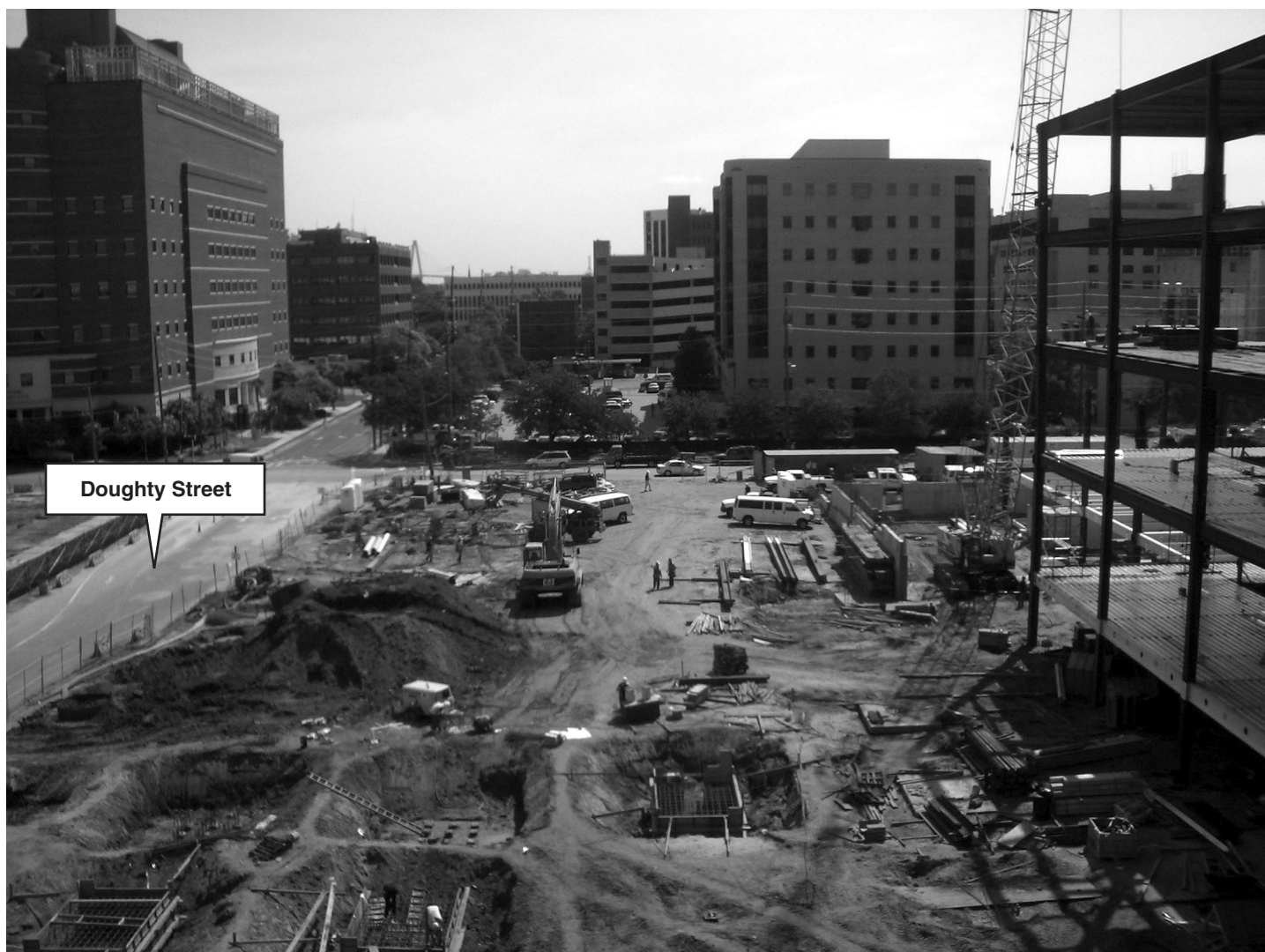
Figure 4: Construction of Phase One of MUSC's Project