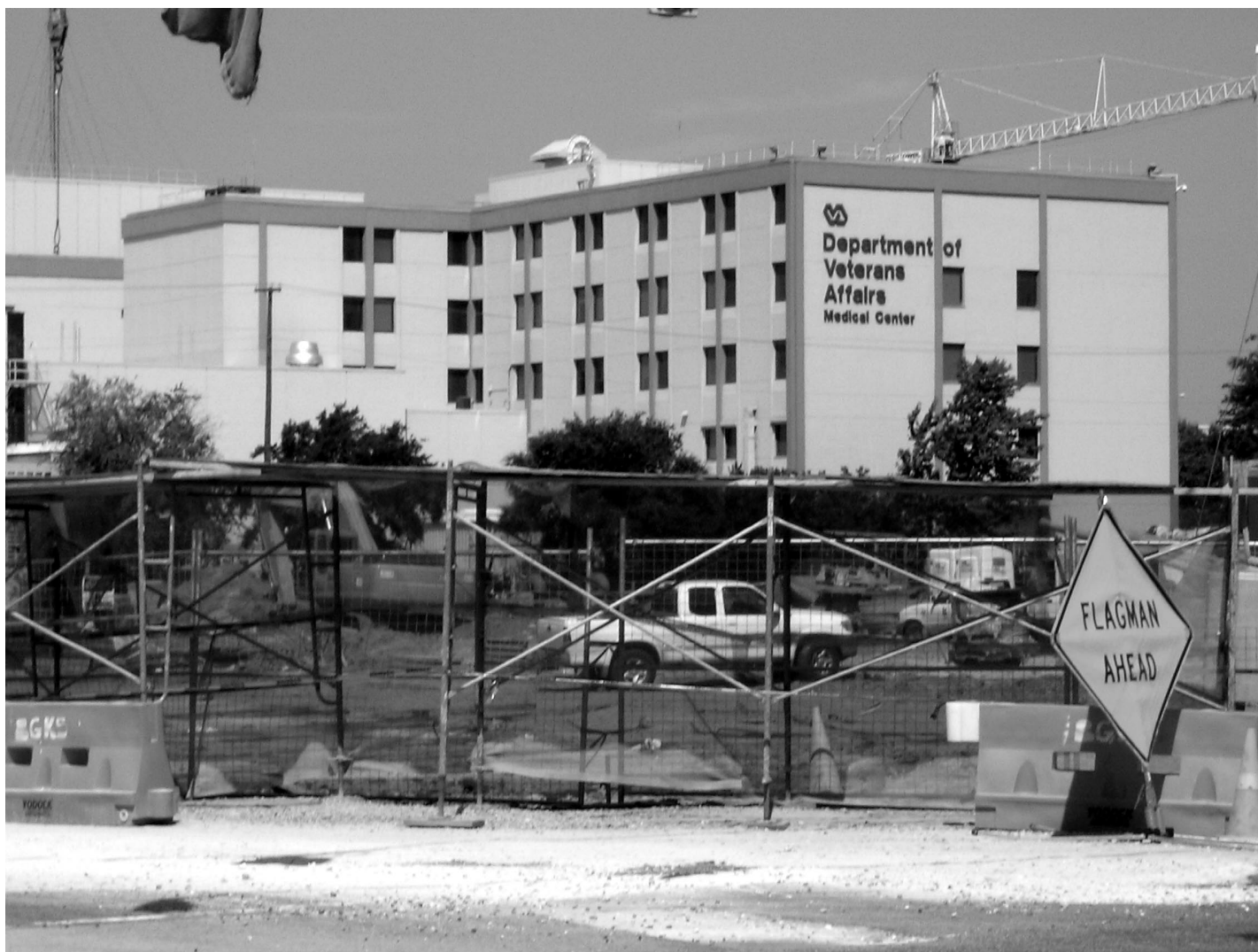
Figure 1: East Side of The Ralph H. Johnson VA Medical Center in Charleston, Adjacent to MUSC Project Construction