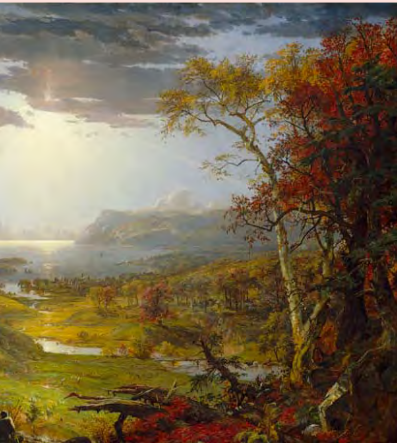
Jasper Francis Cropsey, Autumn—On the Hudson River , 1860, National Gallery of Art, Gift of the Avalon Foundation