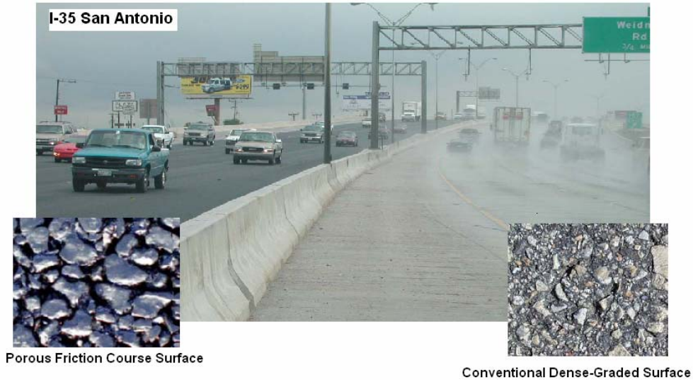
Figure 2. Porous Friction Course Surface (left) Compared to Conventional Surface (right) After a Rain Storm.