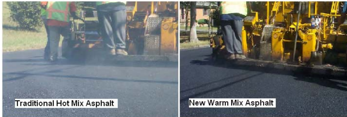
Figure 3. WMA Field Trials in Lufkin, Texas.