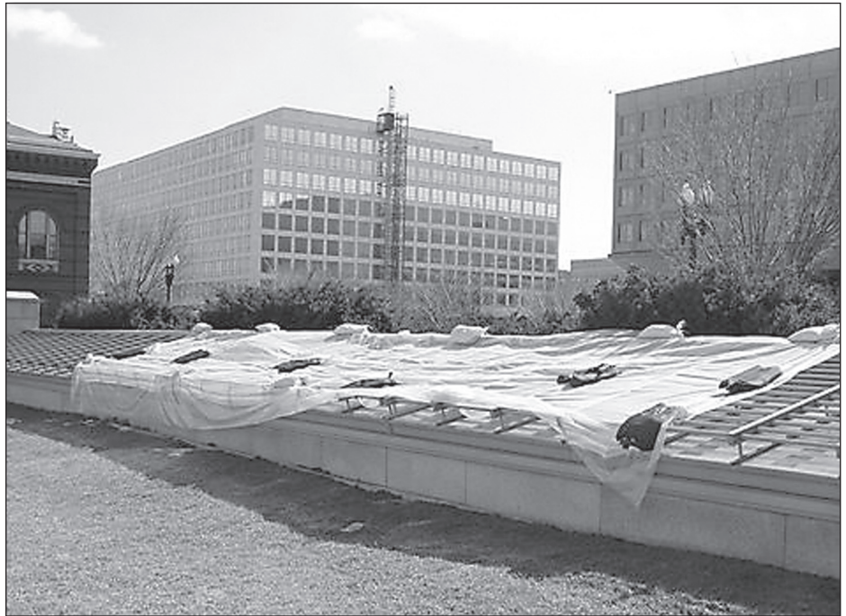
Figure 3: Leaking Skylight Over the National Museum of African Art