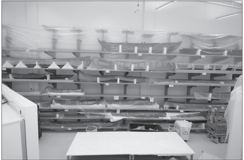
Figure 2: Plastic Sheeting Covering Native American Boats to Prevent Water Damage at the Smithsonian Institution's Cultural Resources Center