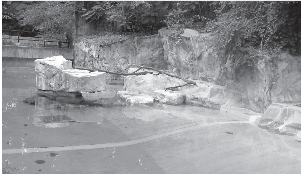
Figure 4: Sea Lion Pool at the National Zoological Park