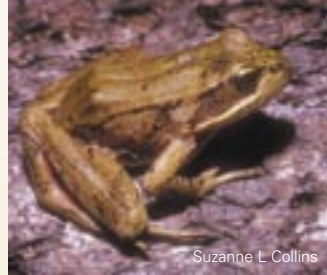
Suzanne L Collins

Five species of native amphibians breed in wetlands of the Willamette Valley (Table 1). A sixth (the Oregon spotted frog) is presumed extinct. Native fish are mostly riverine, but several species arrive with some regularity at wetlands via flooding or connections to riverine habitats: the three-spine stickleback ( Gasterosteus aculeatus ), red-side shiner ( Richardsonius balteatus ), and sculpin ( Cottus spp.).