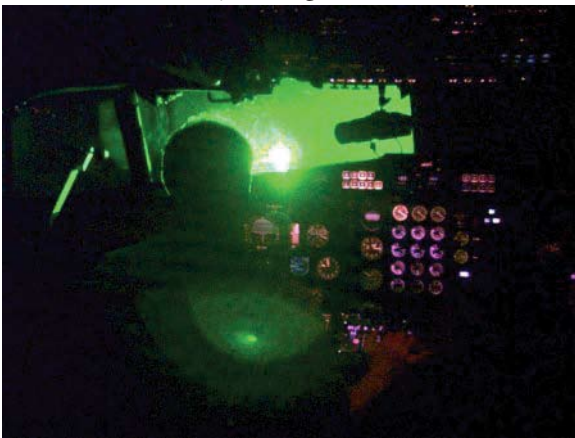
Figure 2: Cockpit glare induced by a 532 nm laser exposure ( 50 \mu\text{W}/\text{cm}^2 ).

Exposure to light that is several orders of magnitude brighter than that to which the eyes are adapted can reduce or eliminate a pilot's ability to correctly perceive depth or clearly see obstacles and the terrain (Figure 2). The period of time and extent to which these effects may last varies considerably among individuals.