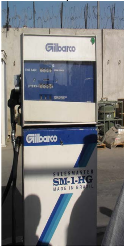
Retail Fuel Pump