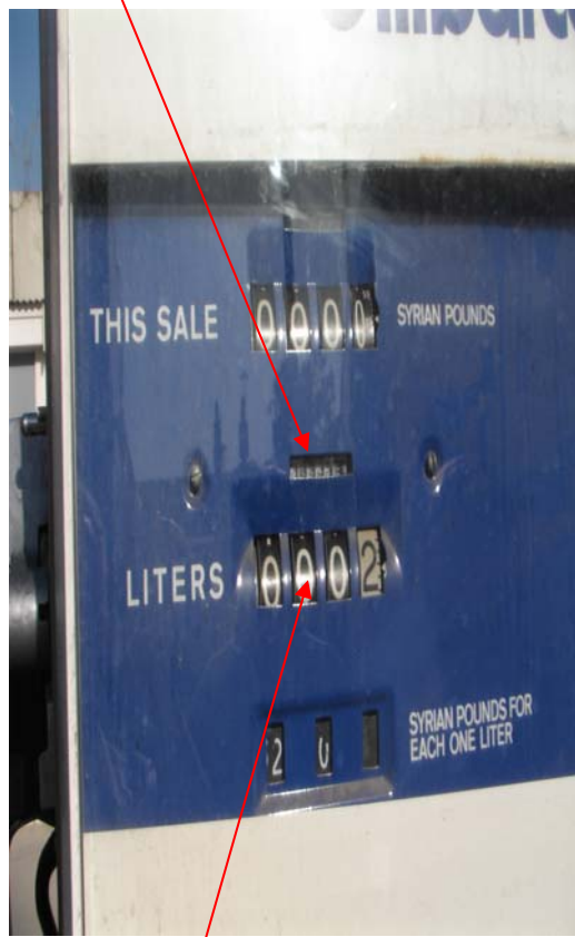
Normal Dispensing Meter