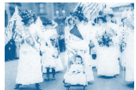
Suffragette parade in New York City in 1912

The 19 th Amendment gave women the ability to vote. It was a result of decades of hard work by the women’s rights movement. This was also known as the women’s suffrage movement. The 15 th