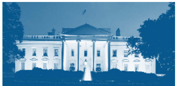
The White House in Washington, DC

The White House was built between 1792 and 1800. President George Washington helped choose its exact location and supervised its construction, but never actually lived there. America’s second President, John Adams, was the