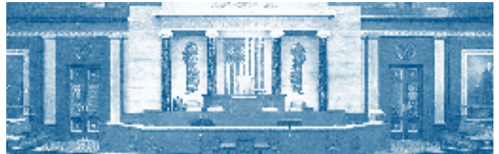
The U.S. House of Representatives in Washington, DC

The House has had 435 members since 1912. Since that year, however, the distribution among the states of those 435 members has changed. This is because the number of Representatives from each state is re-calculated every ten years. New information from the Census is used in this re-calculation. If one state gains many residents while another state loses many, the first state could get one or more new Representatives, while the other state could lose one or more. But the overall number of U.S. Representatives does not change.