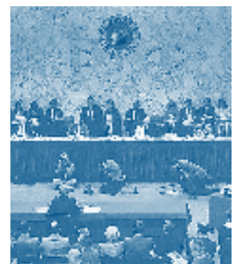
A session of the Senate

Several states, such as California, have term limits for members of their state legislature. Also, several states have considered limiting the number of terms that their U.S. Senators and Representatives can serve. In 1995, the U.S. Supreme Court ruled that no state can do this. The Court stated that such a practice would weaken the national character of Congress. The only way that Congressional terms could be limited is through an Amendment to the U.S. Constitution.