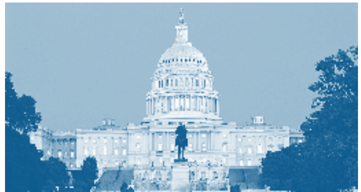
The Capitol in Washington, DC, where Congress meets to make federal laws

The main job of Congress is to make federal laws. Congress is divided into two parts—the Senate and the House of Representatives. By dividing Congress into two parts, the Constitution put the checks and balances idea to work within the legislative branch. Each part of Congress makes sure that the other does not become too powerful. These two "check" each other because both must agree for a law to be made. A Congress divided into two parts is known as a bicameral legislature.