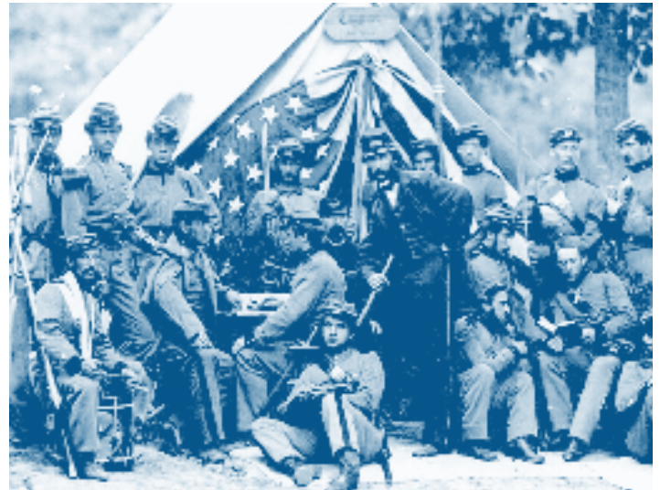
Civil War Engineers in the Union Army

Douglas. These took place when Lincoln and Douglas ran against each other for Illinois' U.S. Senate seat in 1858.