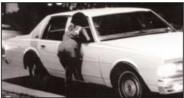
Street prostitution thrives along roads where prostitutes can talk to drivers from the curbside.