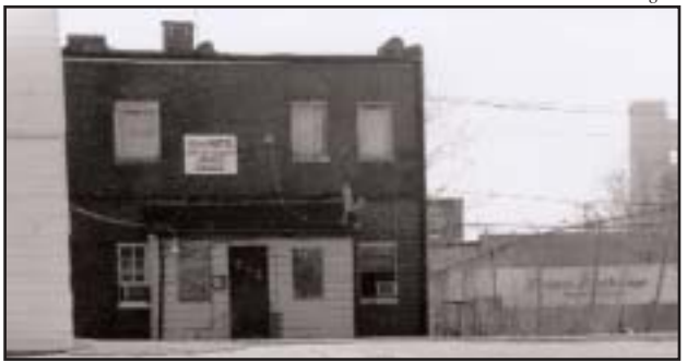
Street prostitution often thrives in areas where there are cheap motels and hotels.