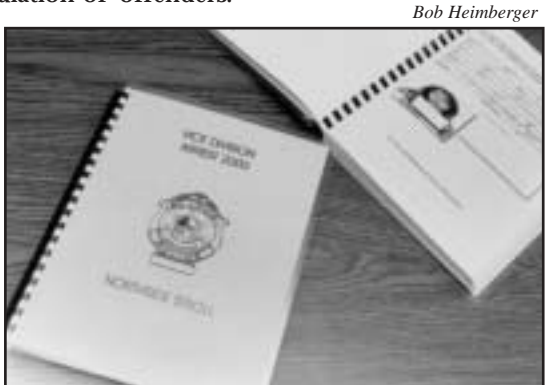
Habitual street prostitutes are usually well-known to police vice units.

Identifying and targeting the worst offenders. A small percentage of prostitutes and pimps may be responsible for most of the complaints in a prostitution area. If you can establish this, you might more productively target your efforts at those few, rather than at the larger population of offenders.