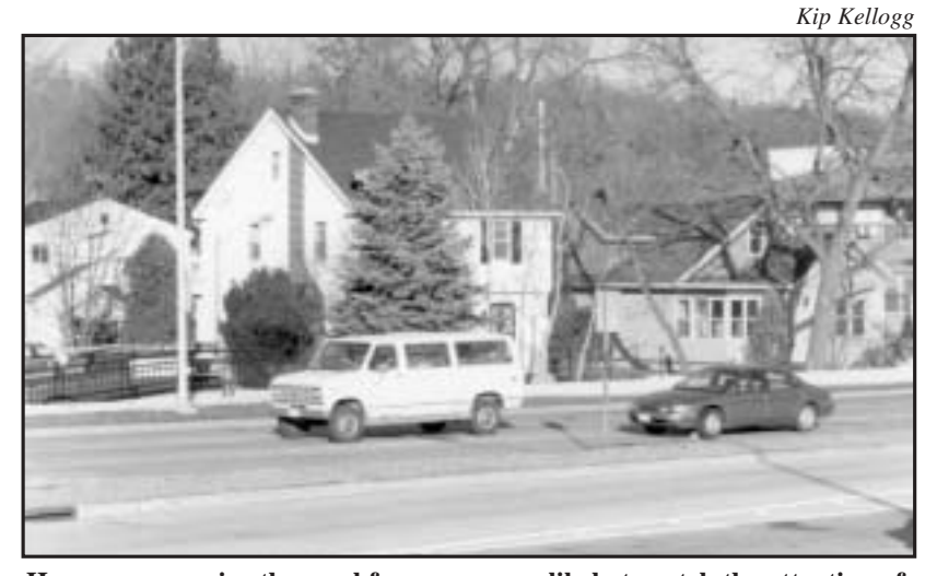
Houses near major thoroughfares are more likely to catch the attention of burglars passing by. Moreover, it is more difficult to distinguish residents and visitors from strangers in heavily traveled areas.