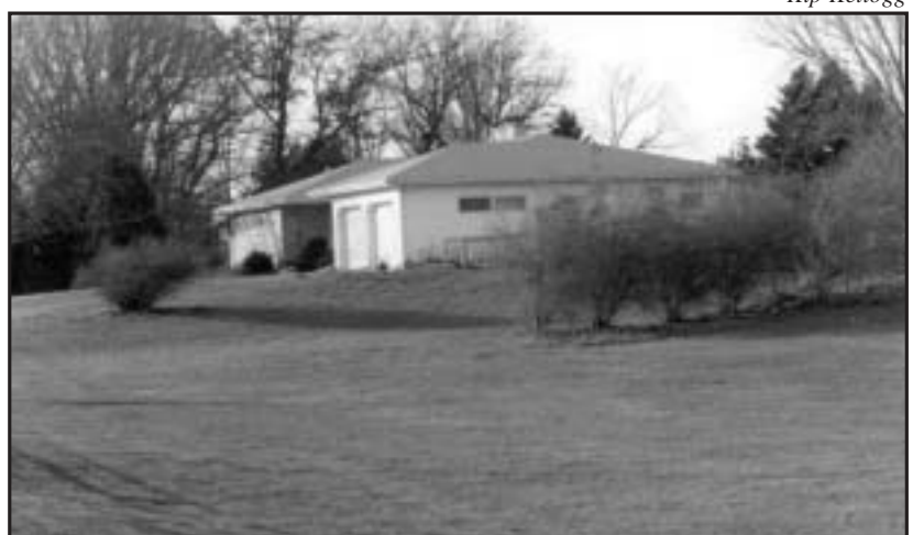
Secluded houses reduce the likelihood that burglars will be seen or heard, and are therefore attractive targets.

• Houses with poor lighting. For houses which are not secluded, poor lighting reduces a burglar's visibility to others. Steady lighting poses the threat that someone may be available to readily see the burglar, while motionactivated security lighting may serve as an alert in secluded areas. Lighting, of course, is not a factor in daytime burglaries, which are more common.