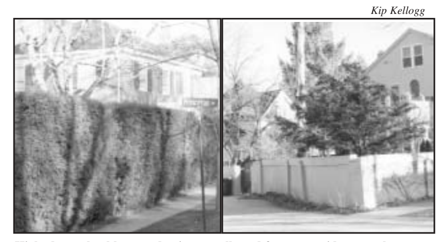
High, dense shrubbery and privacy walls and fences provide concealment, thereby making houses with these features attractive burglary targets.

Houses with cover. For prospective burglars, cover includes trees and dense shrubs—especially evergreens—near doors and windows; walls and fences, especially privacy fences; and architectural features such as latticed porches or garages which project from the front of houses, obscuring front doors. Entrances hidden by solid fencing or mature vegetation—characteristic of many older homes are the entry point in the majority of burglaries of single-family houses.<sup>33</sup>