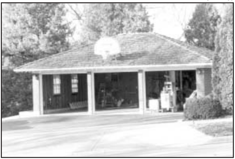
Open garage doors give burglars easy access to items in the garage, potentially provide access to the house, and, if there are no vehicles in the garage, indicate that the house is probably unoccupied.