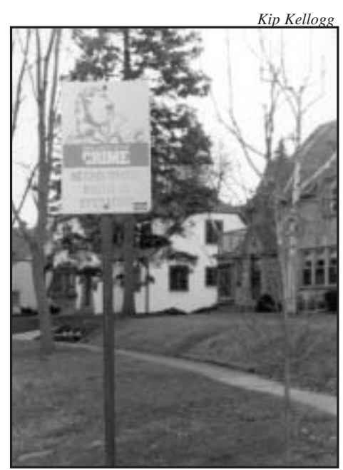
Neighborhood Watch programs have not proved to be particularly effective at reducing residential burglary.

Police have often launched NW programs in response to residential burglary, but the offenses have not consistently declined. NW varies widely, but primarily involves neighbors' watching one another's houses and reporting suspicious behavior. Many NW programs include marking participants' property and assessing their home security to harden targets (see responses 3, 4 and 13). However, many NW participants fail to mark property or follow target-hardening advice, 90 although NW works best when they do so. 91 NW has most often been implemented in low-risk areas with more affluent homeowners. 92 NW has a greater impact when there are some residents at home during the day.