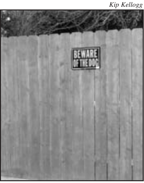
A dog's presence in a house is an effective burglary deterrent.

5. Increasing occupancy indicators. Most burglars avoid encountering residents, and thus look for indicators of occupancy. Such indicators include interior and exterior lights left on (or intermittently turned on and off via timers), closed curtains, noise (e.g., from a television or stereo), cars in the driveway, and so forth. Dogs, alarms and close neighbors can serve as substitutes for occupancy. There are also mockoccupancy devices, such as timers that suggest someone is home. In addition, residents should avoid leaving clues that they are away (e.g., leaving the garage door open when the garage is empty). Before going on vacation, they should have their mail stopped (or ask a neighbor to pick it up), and ensure that their lawns will be maintained in their absence.