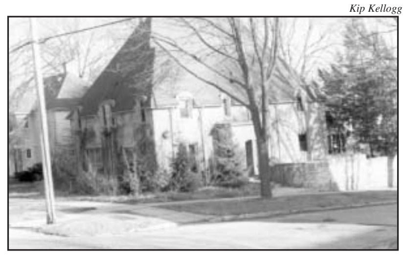
Corner houses offer advantages but also pose risks to burglars: they are more accessible, but police and others can better surveil them.

Houses on corners.<sup>35</sup> Because burglars can often more easily assess corner-house occupancy, and corner houses typically have fewer immediate neighbors, they are more vulnerable to burglary. Burglars may inconspicuously scope out prospective targets while stopped at corner traffic lights or stop signs.<sup>36</sup>