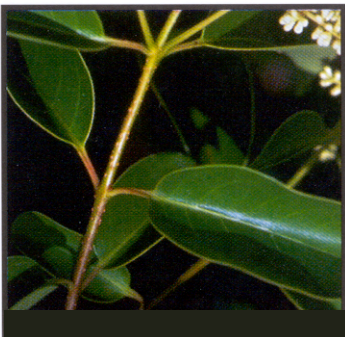
Japanese privet—leaves & twig

Stem: Round, bark light gray and smooth with no fissures. Branches brownish gray with raised light dots ( lenticels ), twigs pale green (sometimes reddish) to gray, not hairy.