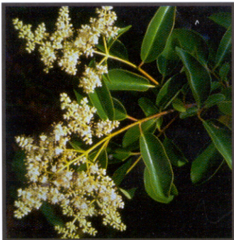
Japanese privet—flowers & leaves

Fruit and Seeds: September–February. A blue-black drupe , 6–10 mm (1/4–3/8 in) long and 5 mm (1/8 in) wide.