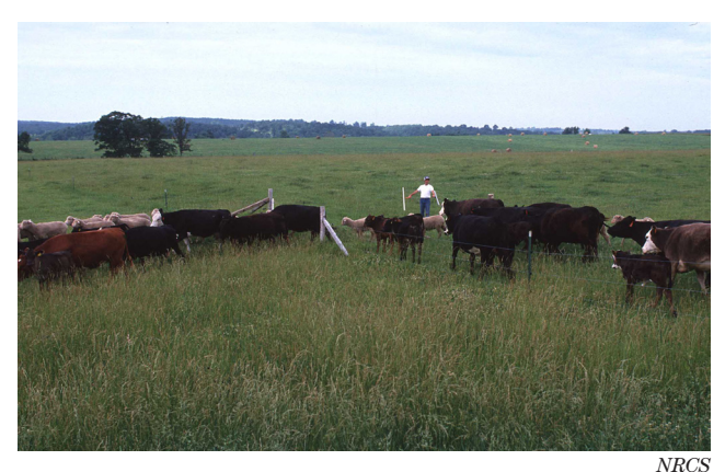
A rancher practices rotational grazing by moving livestock from one paddock to another.

structural states across the landscape beneficial to swift fox and other shortgrass prairie wildlife.