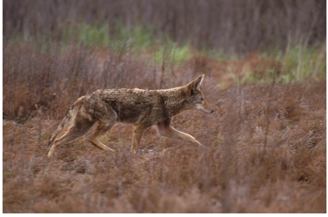
U.S. Fish and Wildlife Service Predation by coyotes is the number one cause of death of swift foxes.

Degraded lands or land used for other purposes can be converted to prairie to increase habitat for swift fox and other grassland species. The Conservation Reserve Program (CRP) has revegetated millions of acres of cropland to grass cover. However, in many areas of the shortgrass prairie ecosystem, CRP fields have been planted to tallgrass prairie species. While tallgrass species are native, they exist only to a limited extent in shortgrass soils and climates, and are unsuitable for swift fox habitat. Seeding mixtures should be selected based on the soil type and climate of the region. Native short and mixed grasses usually associated with swift fox habitat include blue grama