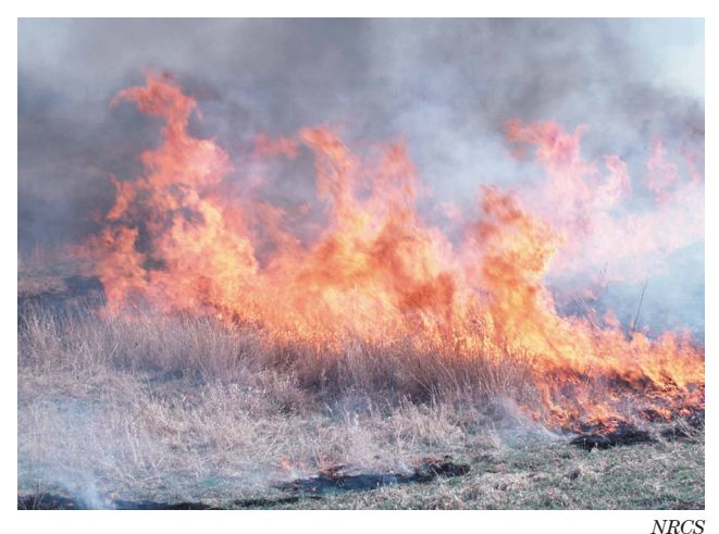
When applied properly, prescribed burns can maintain vegetation preferred by the swift fox.

Interspecific competition with and predation by coyotes is one of the most important limiting factors to swift fox populations. Reducing coyote populations