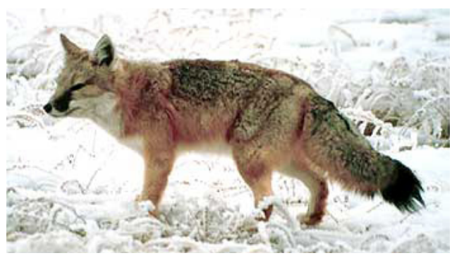
Axel Moehrenschlager, Wildlife Preservation Trust Canada Swift fox (Vulpes velox)

This leaflet is intended to provide an introduction to the habitat requirements of the swift fox and to assist landowners and land managers in developing management strategies that will benefit the swift fox as part of an overall grassland management plan. The success of any management plan depends on targeting the needs of the species involved while considering the needs of the people managing the land. This leaflet provides management recommendations that can be carried out to maintain existing swift fox range and to create additional habitat. Land managers are encouraged to collaborate with wildlife professionals to identify and attain management objectives.