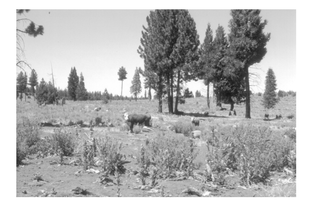
Figure 1 — Carefully planned cattle grazing has aided height growth of young ponderosa pines in northeastern California.

even more uncertain. However, if this introduced species served as a plant favored by cattle, used few site resources, spread over the landscape rapidly, and inhibited the establishment of aggressive plant competitors, it could be useful both for reducing damage to conifer seedlings and serving as a biological control. Several species of grass have the potential to serve in this manner. But grass is notorious for limiting the establishment of conifers in plantations by both physical and chemical interference (Baron 1962, Rietveld 1975, Roy 1953). Grasses can be especially harmful if they constitute favorable habitat for pocket gophers ( Thomomys spp.), who can invade or multiply rapidly and destroy a young pine plantation (Crouch 1986). However, if the grasses become established after the pines are growing well, they may reduce competition and help more than hinder (McDonald 1986).