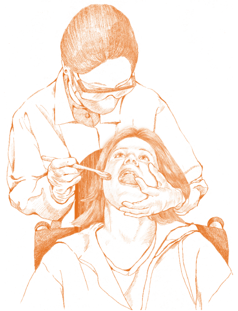
Positioning for treating a patient in a wheelchair. Note the support a sliding board can provide. Sliding or transfer boards are available from home health care companies.

UNCONTROLLED BODY MOVEMENTS can jeopardize safety and your ability to deliver dental care. Pay special attention to the following: