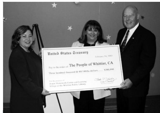
Congresswoman Sánchez presents $300,000 for Learning Village in Whittier.

I help local community groups find federal grants, and advocate for funding when they apply. Contact my office for federal grant assistance.