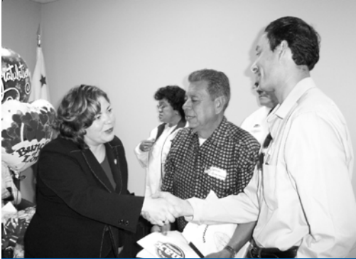
Linda meets constituents at her district office in Lakewood.

Congresswoman Linda Sánchez is Here to Help You .