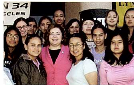
Congresswoman Linda Sánchez meets with local high school students to discuss government issues.

For too long, bullying has been an overlooked problem. Bullying takes away students' ability to learn, feel safe, and develop strong self-esteem. That's why I wrote the "School Safety and Violence Protection Act." The bill would provide grants to states that implement comprehensive anti-bullying programs, and would create a statewide hotline for anonymous reporting by students and staff with information on bullying.