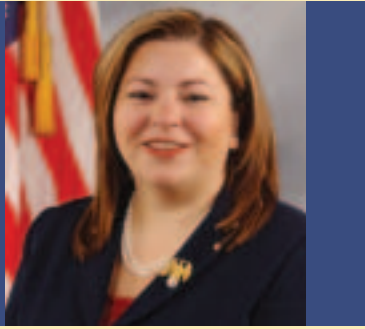
Congresswoman Linda Sánchez