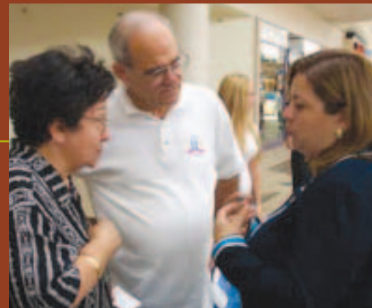
Congresswoman Linda Sánchez discusses her work in Congress and ways to strengthen the economy.