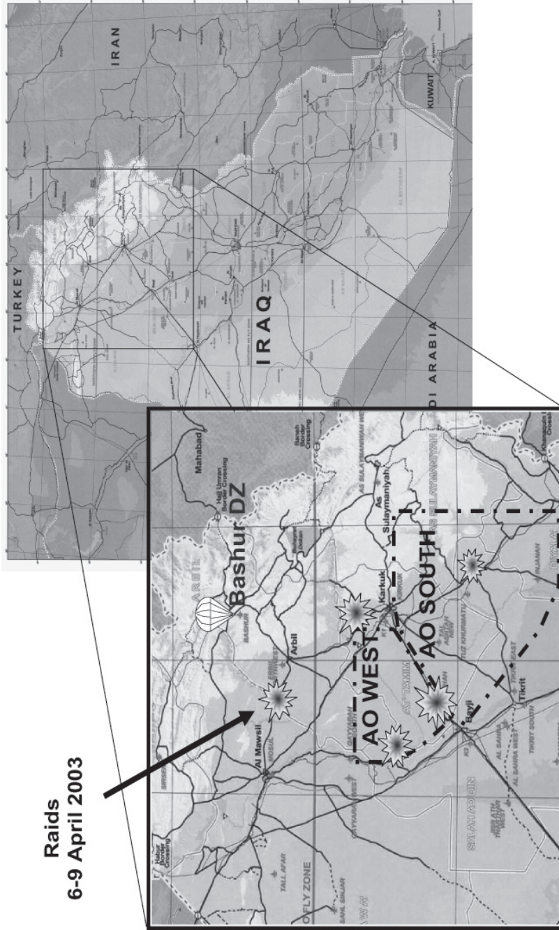
Red Devil Operations (March – October 2003).