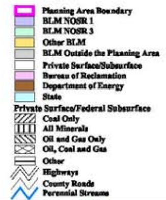
Figure 1-2 Land Status Roan Plateau RMPA/EIS