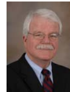
Representative George Miller (D-CA)

CHAIRMAN Committee on Education and Labor