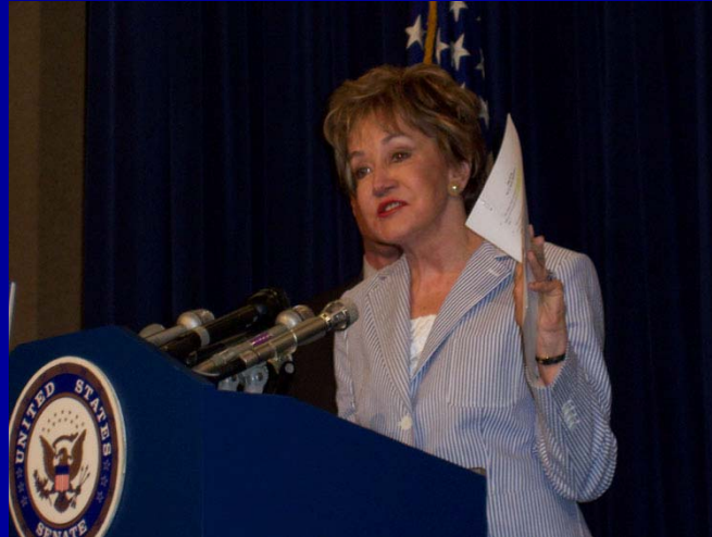
Dole addresses reporters at a Senate press conference. (June 2007)