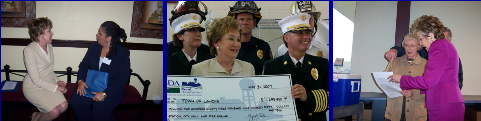
Left to right, Dole talks with a constituent at a homeownership workshop in Greenville (August 2007); presents Rural Development funding in Landis (May 2007); and meets Meals-On-Wheels volunteers in Winston-Salem (February 2007).