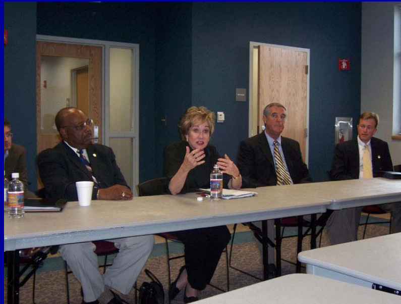
Dole hears concerns from local officials about a potential OLF in Eastern North Carolina. (Elizabeth City, October 2007)