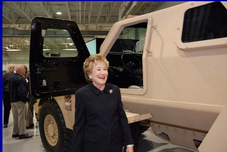
Dole gets an up close look at a Mine Resistant Ambush Protection (MRAP) vehicle at Force Protection in Roxboro. (November 2007)