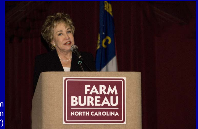
Dole addresses the N.C. Farm Bureau's annual meeting in Greensboro. (December 2007)