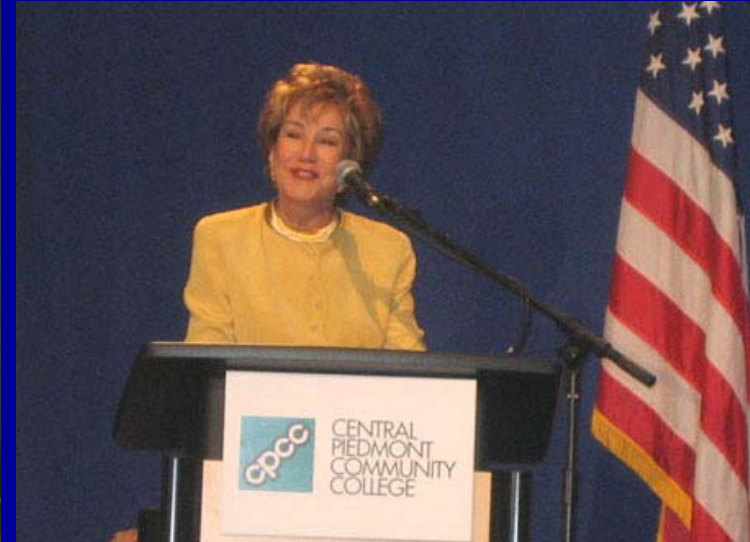
Dole helped organize and spoke at the Regional BRAC Hearing in Charlotte. (June 2005)