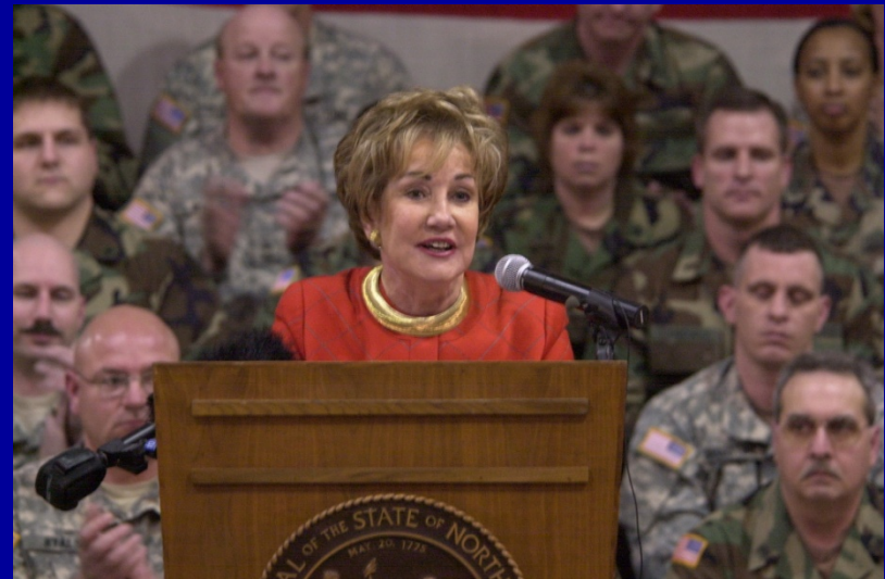
Dole accepts the Charles Dick Medal of Merit from the National Guard in Raleigh. (February 2006)