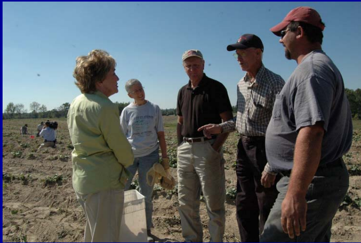
Above, Dole gleans sweet potatoes for the hungry in Harnett County (October 2007)