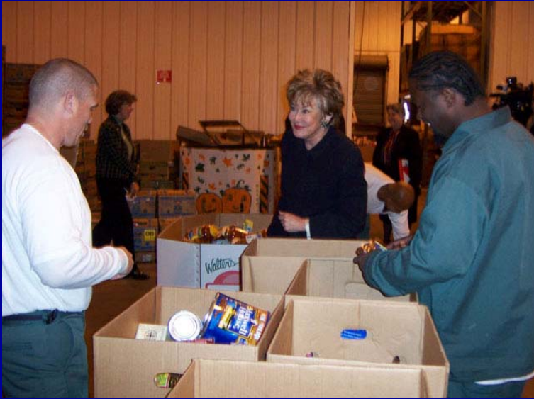
Dole visits Second Harvest Food Bank in Charlotte. (February 2007)