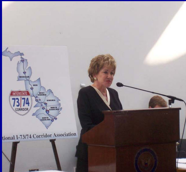
Dole speaks at a Senate briefing about the Interstate-73/74 corridor. (September 2007)