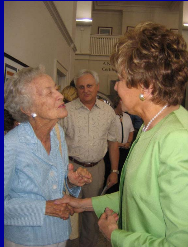
Dole in Forest City. (August 2006)