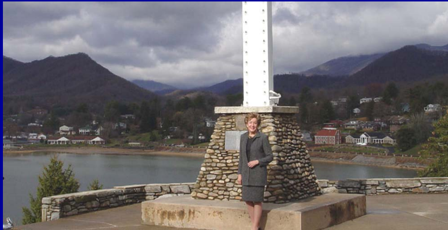
Dole at Lake Junaluska. (September 2004)