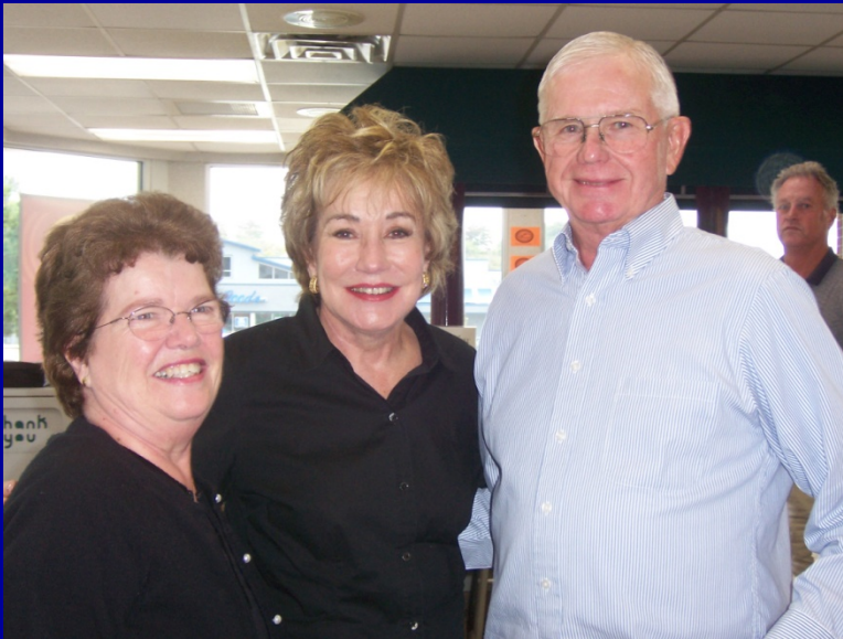
Dole talks with constituents at a lunch stop in Kitty Hawk. (October 2007)