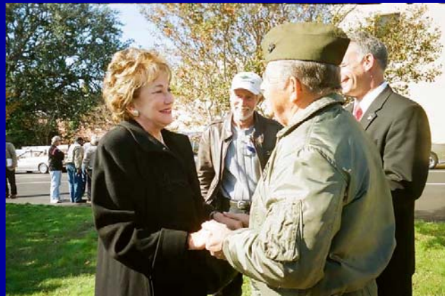
Dole greets veterans at a Veterans Day parade in Morehead City. (November 2007)