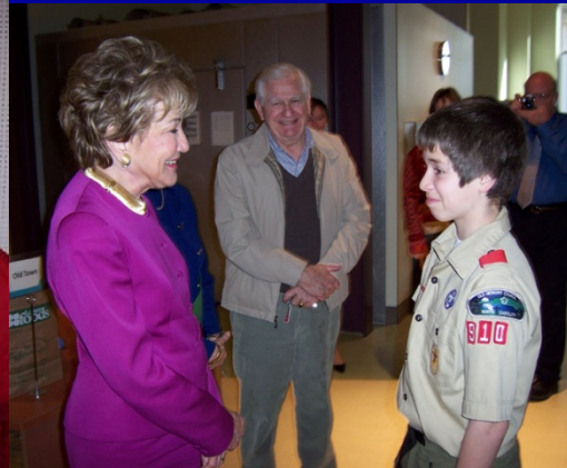
Left, Dole with constituents from Butner in Washington, D.C. (March 2007) and above, in Winston-Salem (February 2007).