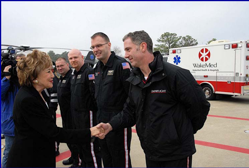
Dole visits WakeMed Raleigh Campus. (January 2008)