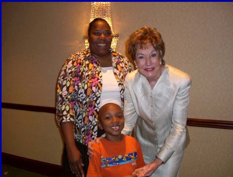
Dole hosts a homeownership workshop in Hickory. (June 2007)