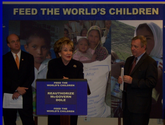
Dole and Sen. Dick Durbin introduce legislation that reauthorizes and expands the McGovern-Dole International Food for Education and Child Nutrition Program. (March 2007)