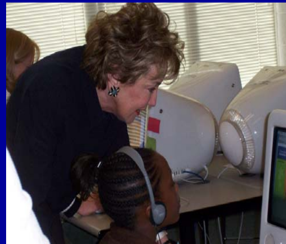
Dole with students at Hanford-Dole Elementary School in Salisbury. (February 2007)