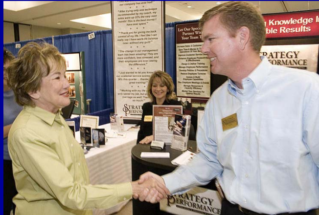
Dole at a Business Expo in Rocky Mount. (October 2007)