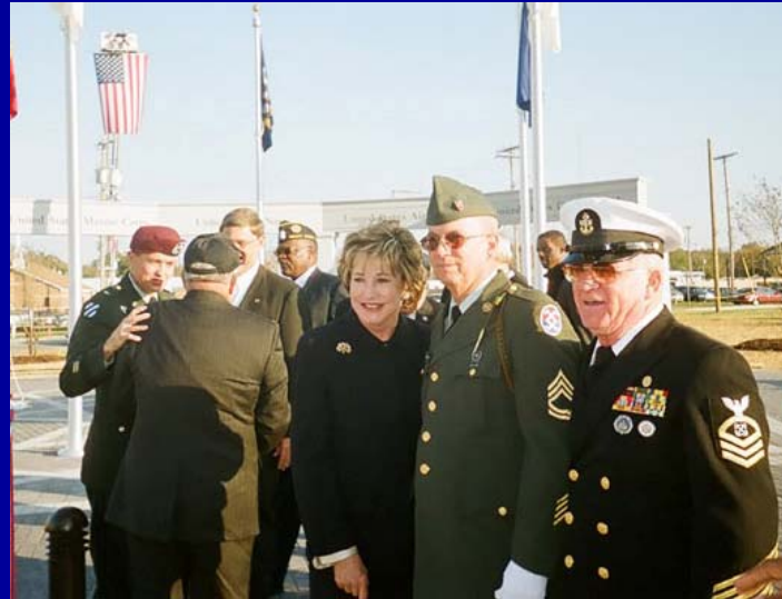
Dole at the dedication of the Veterans Memorial at Jack Laughery Park in Rocky Mount. (November 2007)