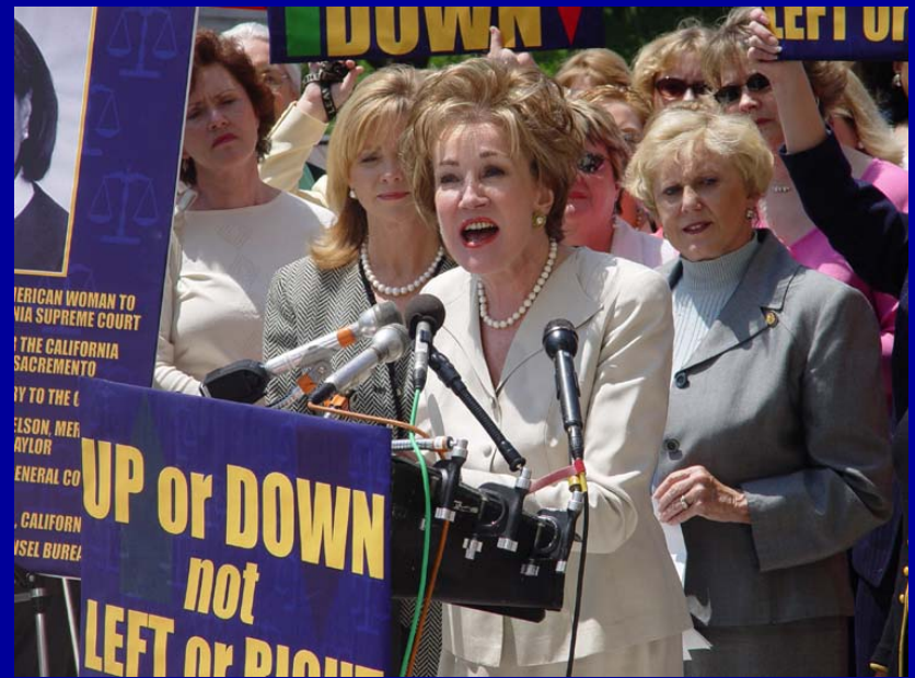
Dole calls for up-or-down votes for judicial nominees. (May 2005)