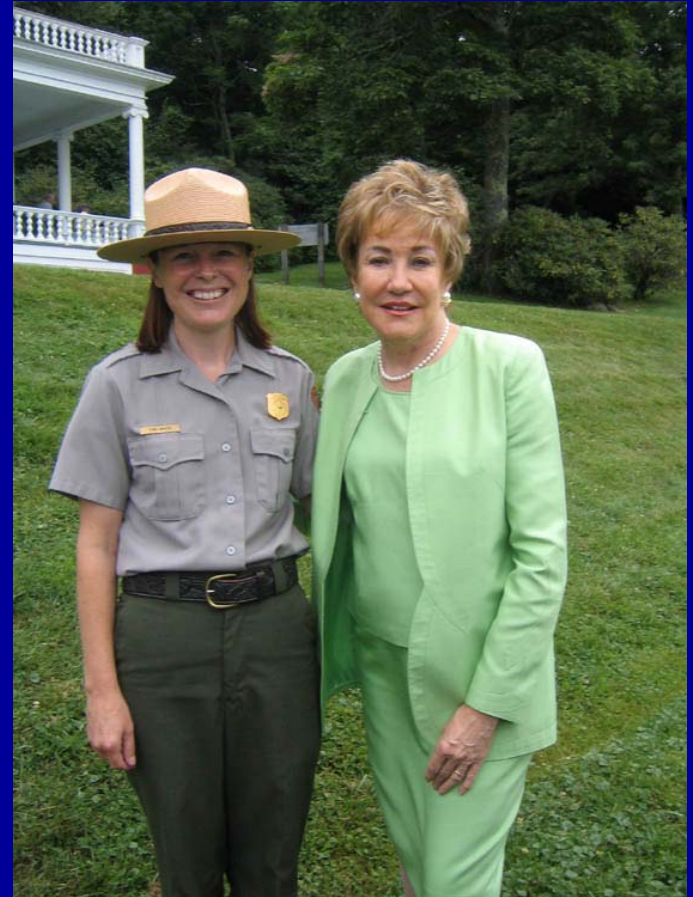
Dole meets with Park Rangers at the Moses H. Cone estate on the Blue Ridge Parkway. (August 2006)