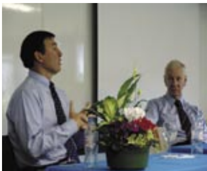
Citizens counting ballots in Cameroon's 2004 presidential election and casting votes in Ukraine's historic 2004 presidential election. Association Members were actively involved in the monitoring of both of these elections. During a 2006 Congress to Campus UK program visit, former Members Tom Downey (D-NY) and Lou Frey (R-FL) speak to a group of students.

The Congress to Campus Program has also operated at colleges and universities in China, the United Kingdom, and Germany. Because of the popularity of this program, former Members also speak to high schools and civic organizations and attend community forums. While students and citizens alike benefit from these discussions about former Members' experiences, the former Members themselves learn about the interests and concerns of the next generation of leaders. To administer the program, the Association collaborates with the Center for Democracy and Citizenship and the Stennis Center for Public Service. These invaluable alliances have allowed the program to expand considerably in recent years, with an average of over 30 visits a year.