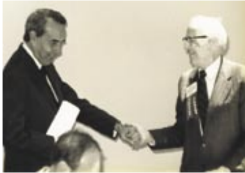
Association Members and Statesmanship Award recipients Lee Hamilton (D-IN) and Bob Dole (R-KS) participate in USAFMC events while serving in Congress.