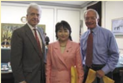
Former Members meet with Japanese Diet Members and other government officials, for example Hon. Kuniko Inoguchi, Minister of State for Gender Equality and Social Affairs, during her visit to DC in 2006 (above). The Congressional Study Group on Japan has become even more critical in recent years due to the increasing importance of the U.S.-Japanese relationship, especially in the areas of economic and international security policy.

-His Excellency Nabi Sensoy Ambassador of Turkey to the United States