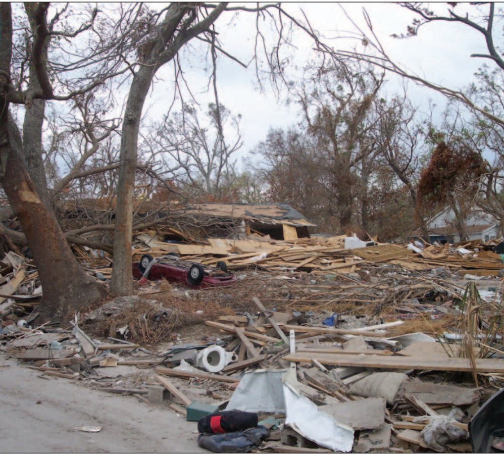
Near the beach, Biloxi, MS