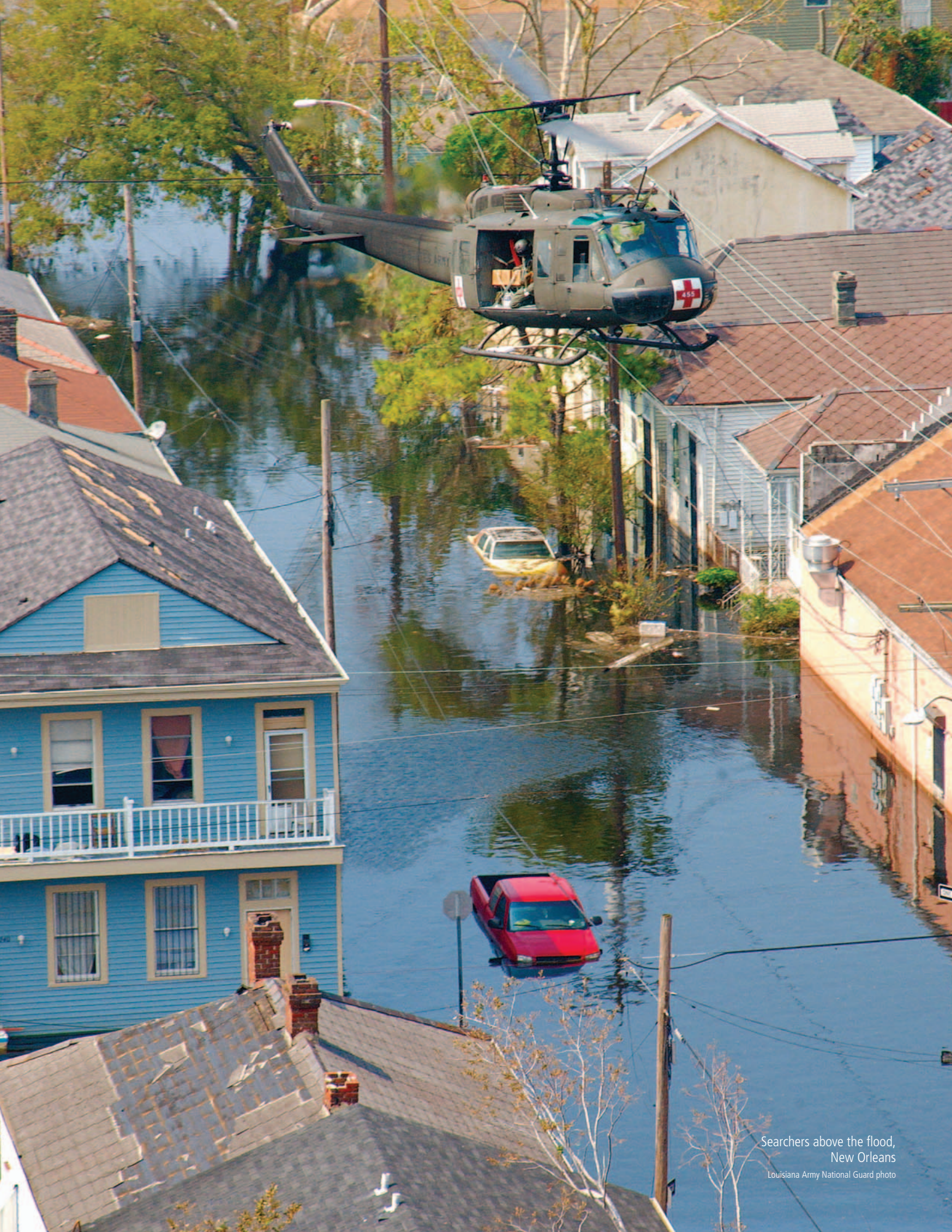
Searchers above the flood, New Orleans