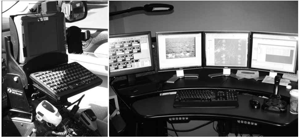
Figure 3: At Left, Mounted Laptop Installed in Border Patrol Vehicle; at Right, Project 28 Command and Control Center