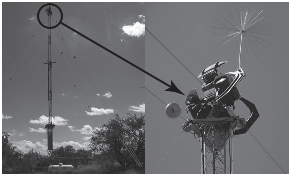
Figure 2: Project 28 Mobile Sensor Tower Deployed in Tucson Sector

cameras and radars—on schedule. 10 See figures 2 and 3 below for photographs of SBI net technology along the southwest border.