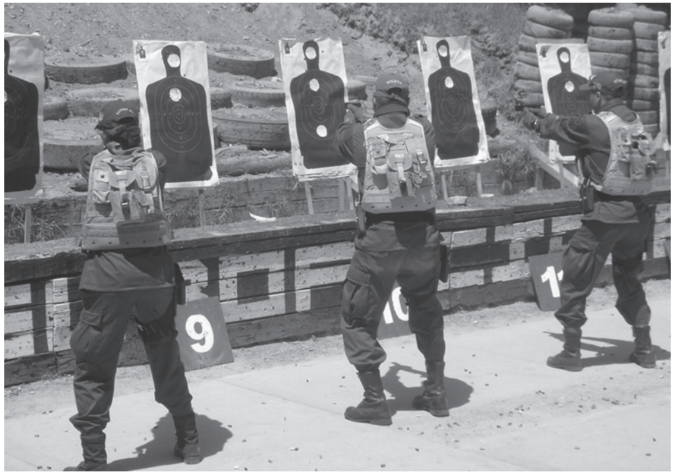
Figure 1: Training Exercise at ATA Facility in Colombia