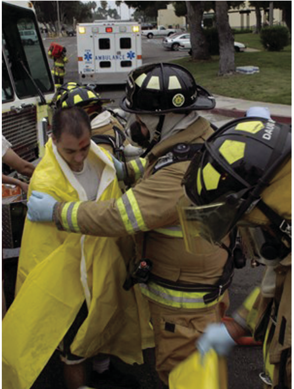
Figure 2: Emergency Personnel Assist Individual in Chemical/Biological Exercise