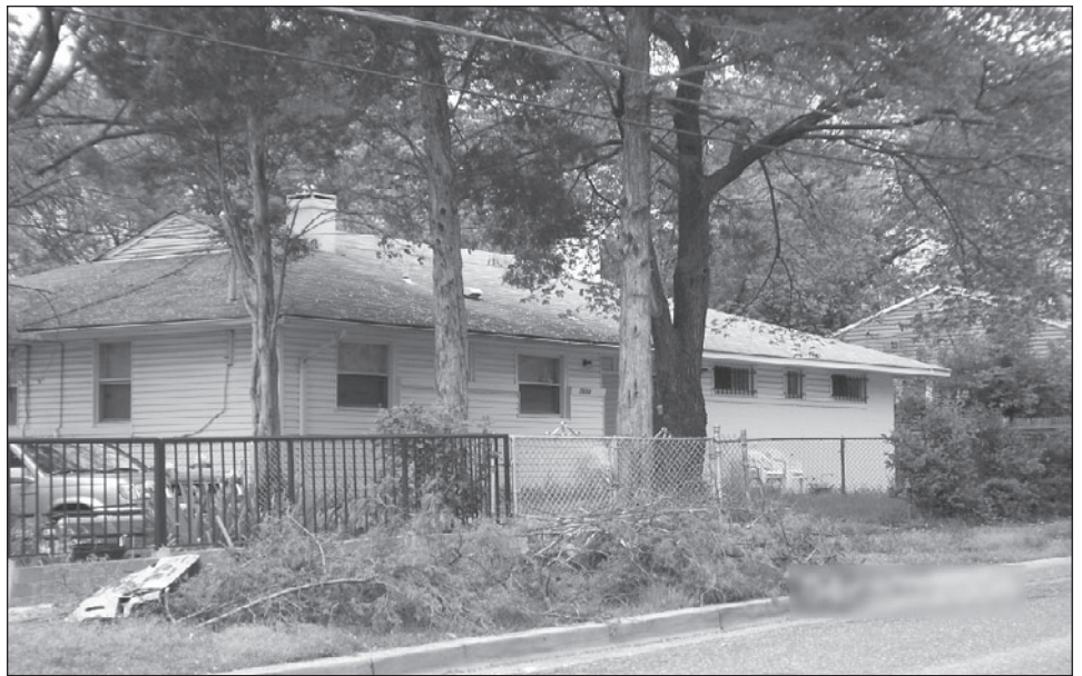
Figure 4: Principal Office for Case Study 2 Firm

While he self-certified to the firm’s HUBZone status in ORCA in September 2007, the vice president admitted during our interview in April 2008 that the firm did not meet HUBZone requirements. Nonetheless, after our interview, the firm continued actively to represent that it was a HUBZone firm—including a message in large letters on its Web site and business cards declaring that the firm was “HUBZone certified.” The firm’s vice-president self-certified during the SBA’s HUBZone certification process in March 2007 that, as shown in figure 4, the firm’s principal office was one-half of a residential duplex in Landover, Maryland.