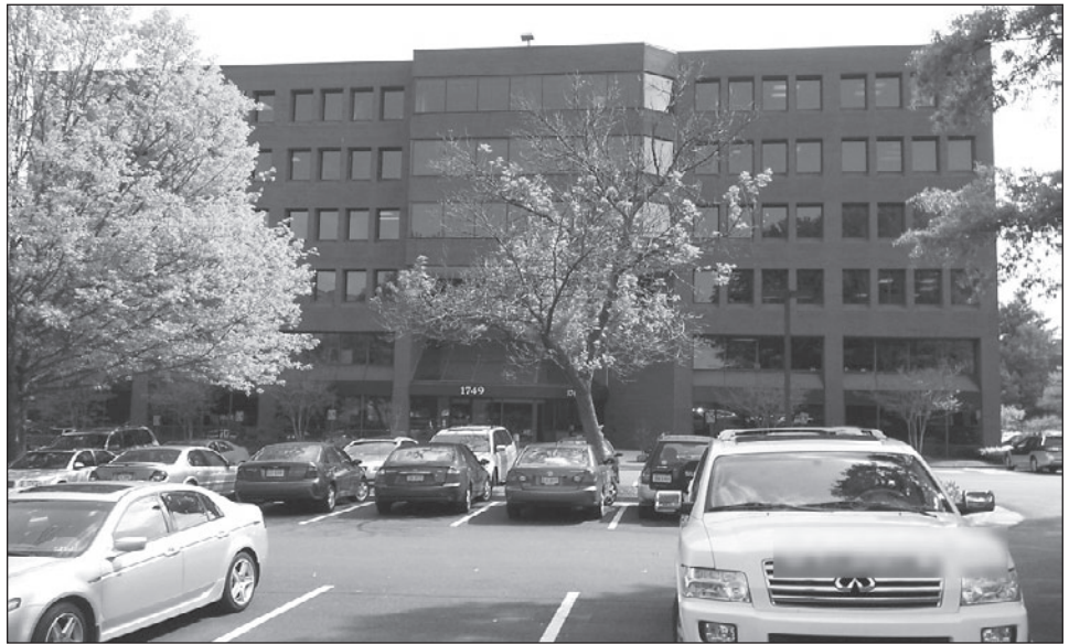
Figure 3: Headquarters for Case Study 1 Firm