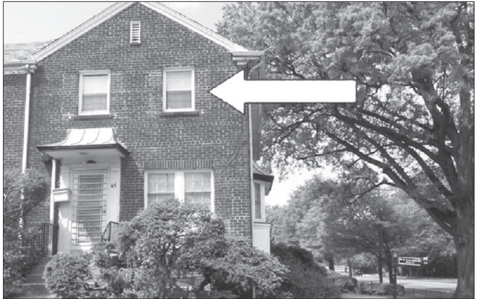
Figure 2: Principal Office for Case Study 1 Firm

of the building the firm claimed as its principal office (arrow indicates where the office is located).