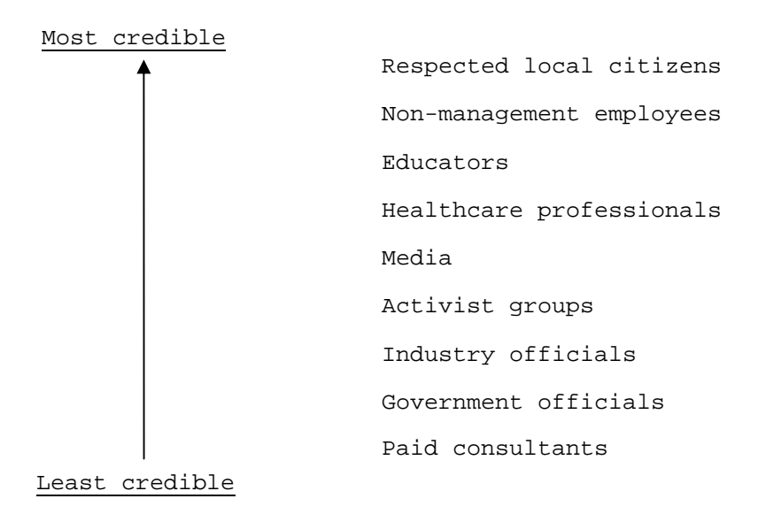
Fig. 3 Credibility Ladder