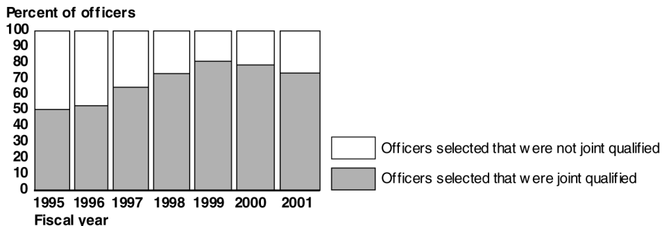
Percentage of Officers Promoted to General or Flag Rank with Joint Experience between Fiscal Years 1995 and 2001

DOD has met provisions in the act that require it to develop officers in joint matters through education by establishing a two-phased joint professional military education program. The act, however, did not establish specific numerical requirements, and DOD has also not determined the number of officers who should complete the joint education. In fiscal year 2001, only one-third of the officers who were serving in joint organizations had completed both phases of the education. DOD has also increasingly relied on allowable waivers and has not filled all of its critical joint duty positions with officers who hold a joint specialty designation. This number reached an all-time high in fiscal year 2001 when DOD did not fill 311, or more than one-third, of its 808 critical joint duty positions with joint specialty officers.