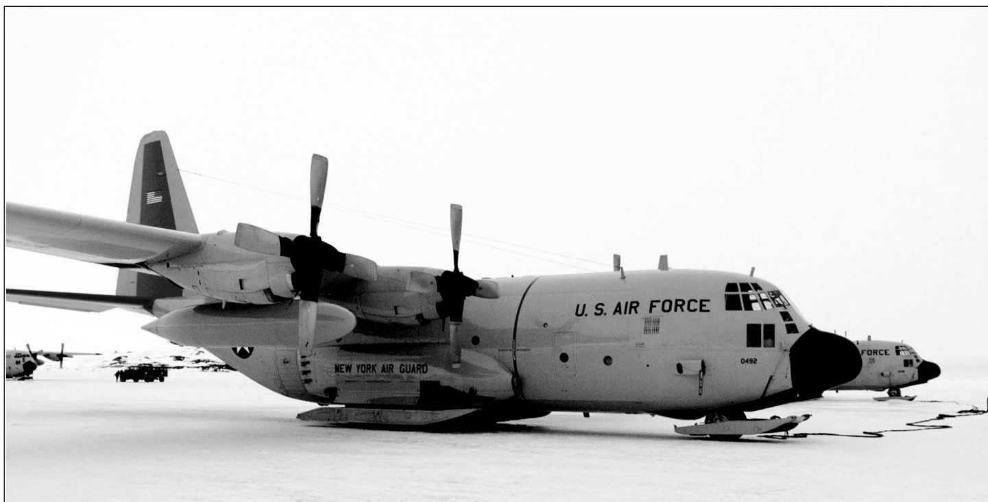
Figure 1: Ski-Tipped LC-130 Aircraft Operated by the 109th Airlift Wing, New York Air National Guard