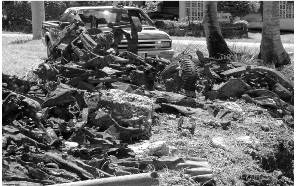
Figure 2: DOD Debris Unearthed While Excavating Private Property in Guam