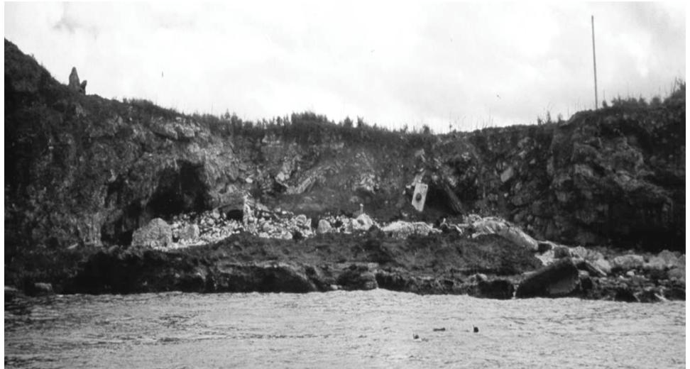
Figure 1: Navy Disposal Site at Orote Point Before Restoration