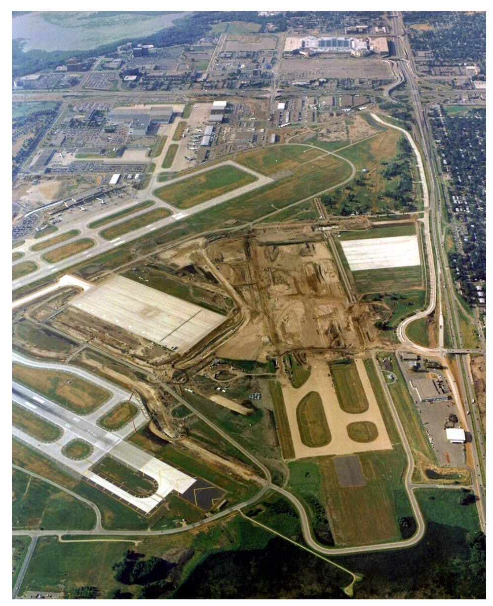
Figure 3: Increasing Airport Capacity through Runway Development