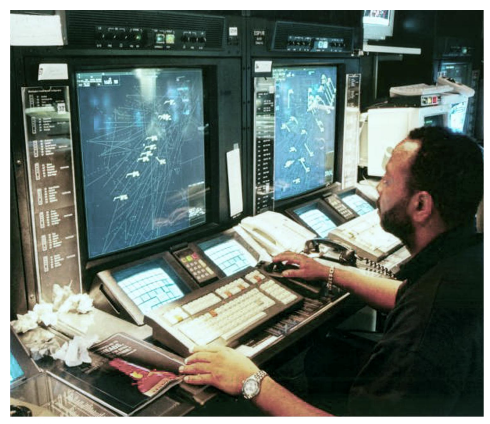
Figure 5: Air Traffic Controller