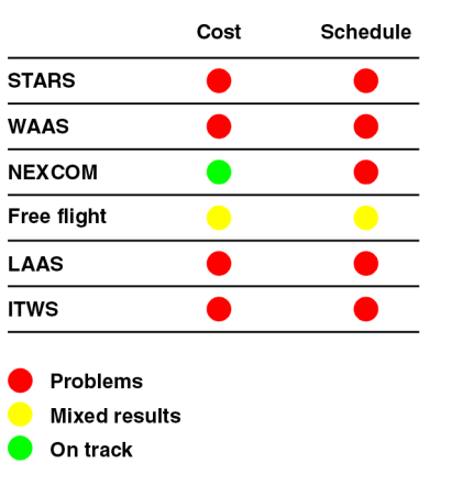
Figure 4: Status of Selected FAA Air Traffic Control Projects

FAA is making progress in managing the air traffic control modernization effort and has implemented some key projects. For example, the agency has replaced the automated color display equipment used by air traffic controllers to control traffic in some facilities (Display System Replacement); installed the initial phase of the computer that receives, processes, and tracks aircraft movement throughout the airspace system (HOST computer); and implemented some free flight technologies that are expected to allow for more efficient use of the system by improving operations in various segments of flight. Figure 5 shows an FAA representative using the Display System Replacement to monitor and handle air traffic.