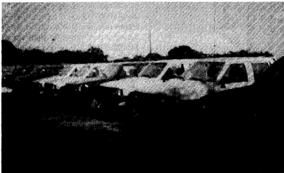
Figure I.2: Vehicles Impounded in Managua Dealerships (May 1988)

The organization also purchased equipment that could not be used due to the curtailment of verification activities resulting from political events during 1988. Of 13 computers purchased at a cost of about $32,000 for use in Washington, D.C., Managua, and the cease-fire zones, only four could be used—two in the Washington office and two in the Managua office. According to the Cardinal's staff, the remaining nine are now being stored in Miami, pending possible use.