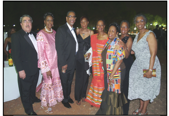
CBC Members Visit Ghana for 50th Anniversary Celebration