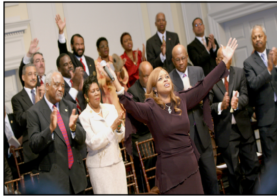
Karen Clark Sheard performs at CBC Leadership Swearing In Ceremony