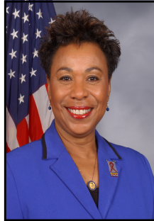
Rep. Barbara Lee (CA) First Vice Chair