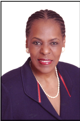
Rep. Carolyn C. Kilpatrick Chairwoman