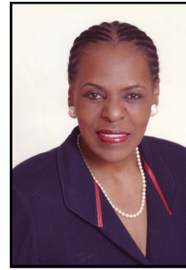
Rep. Carolyn C. Kilpatrick (MI) Chairwoman