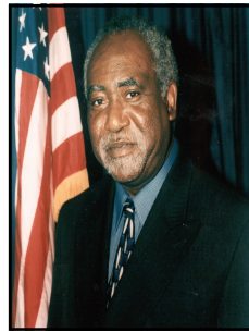
Rep. Danny K. Davis (IL) Secretary