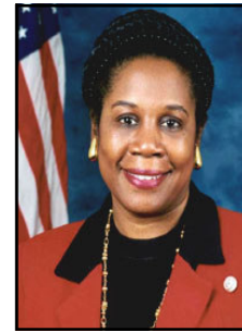
Rep. Sheila Jackson Lee (TX) Whip

Since 1971, the Members of the Congressional Black Caucus (at times referred to herein as the "CBC" or "Caucus") have joined together to strengthen their efforts to empower America's neglected citizens—including but not limited to Americans of color—by more effectively addressing our legislative concerns. The Congressional Black Caucus is committed to utilizing the full constitutional power, statutory authority, and financial resources of the Government of the United States of America to ensure, insofar as possible, that everyone in the United States has an opportunity to live out the American Dream. The legislative agenda of universal empowerment that the Members of the Caucus shall collectively pursue shall include, but are not limited to: the creation of universal access to a world class education from birth through post secondary level; the creation of universal access to quality, affordable health care and the elimination of racially based health disparities; the creation of universal access to modern technology, capital, and full, fairly-compensated employment; the creation and or expansion of UA foreign policy initiatives that will contribute to the survival, health, education, and general welfare of all peoples of the world in a manner consistent with universal human dignity, tolerance, and respect, and such other legislative action as a majority of the entire CBC membership from time to time may support.