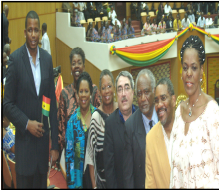
Members visit Ghana's Parliament for Re-enactment of the Parliamentary event at which Dr. Kwame Nkrumah received the scroll of independence.