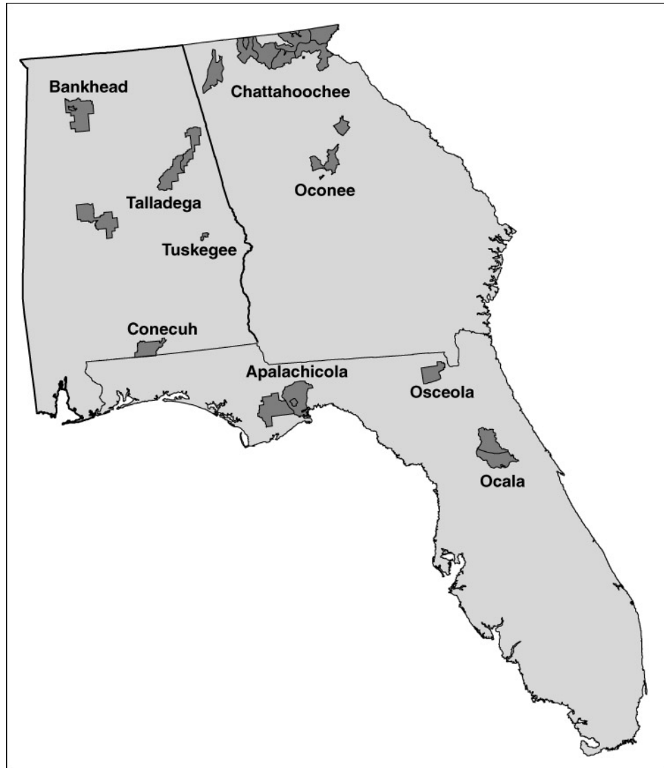
Figure 1: National Forests in Alabama, Florida, and Georgia